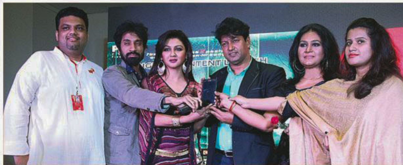
Guests at the event.