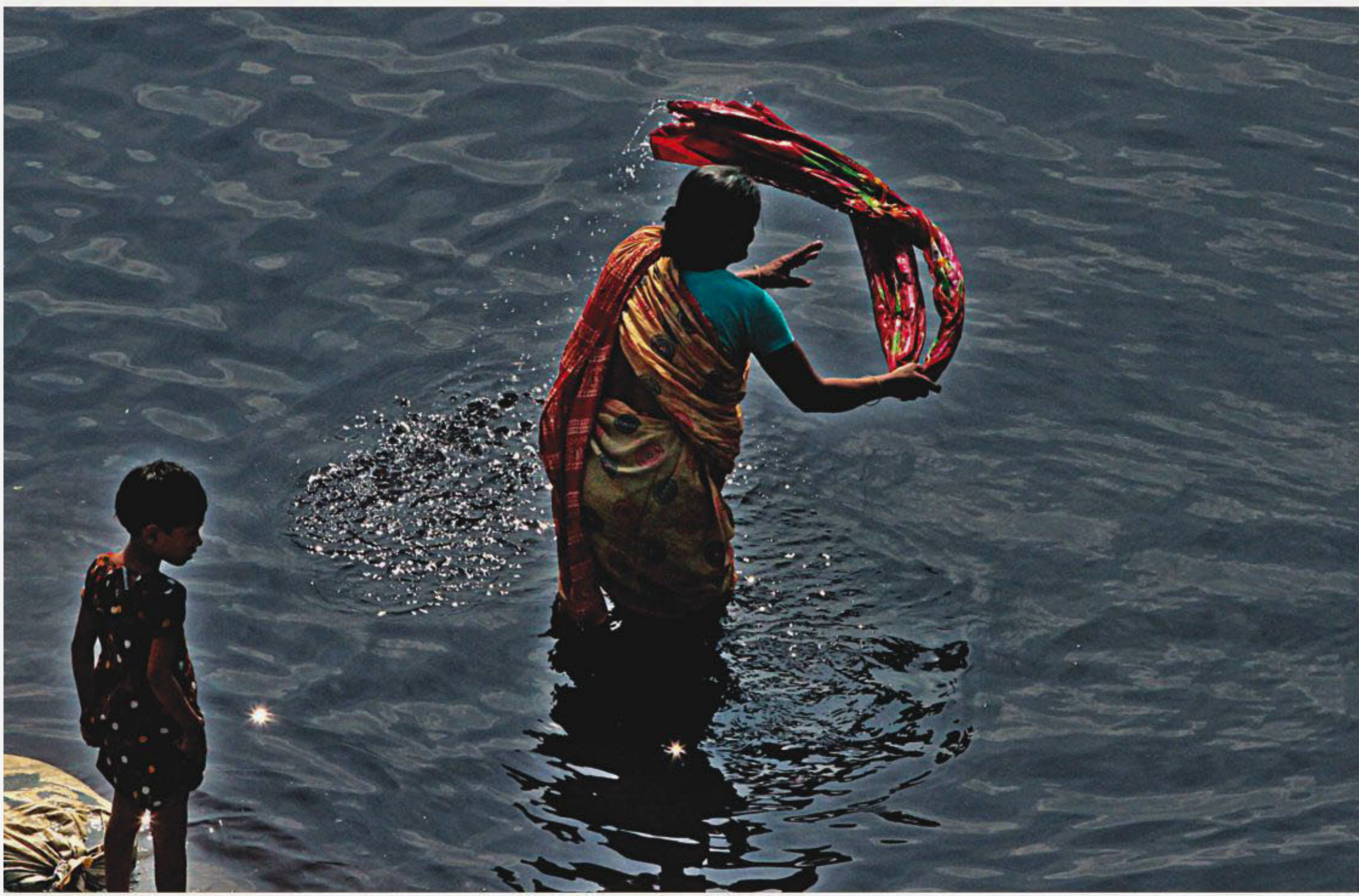
Who would have thought that this is the same Shitalakkhya river where the monsoon brought in translucent waters a couple of months ago. Continuous and unabated discharge of untreated effluent and the longstanding presence of solid waste littering the riverbed have again turned it into an eyesore, signified by a horrible stench enveloping the surrounding area. The photo was taken at Kanchpur, right outside the capital, yesterday.