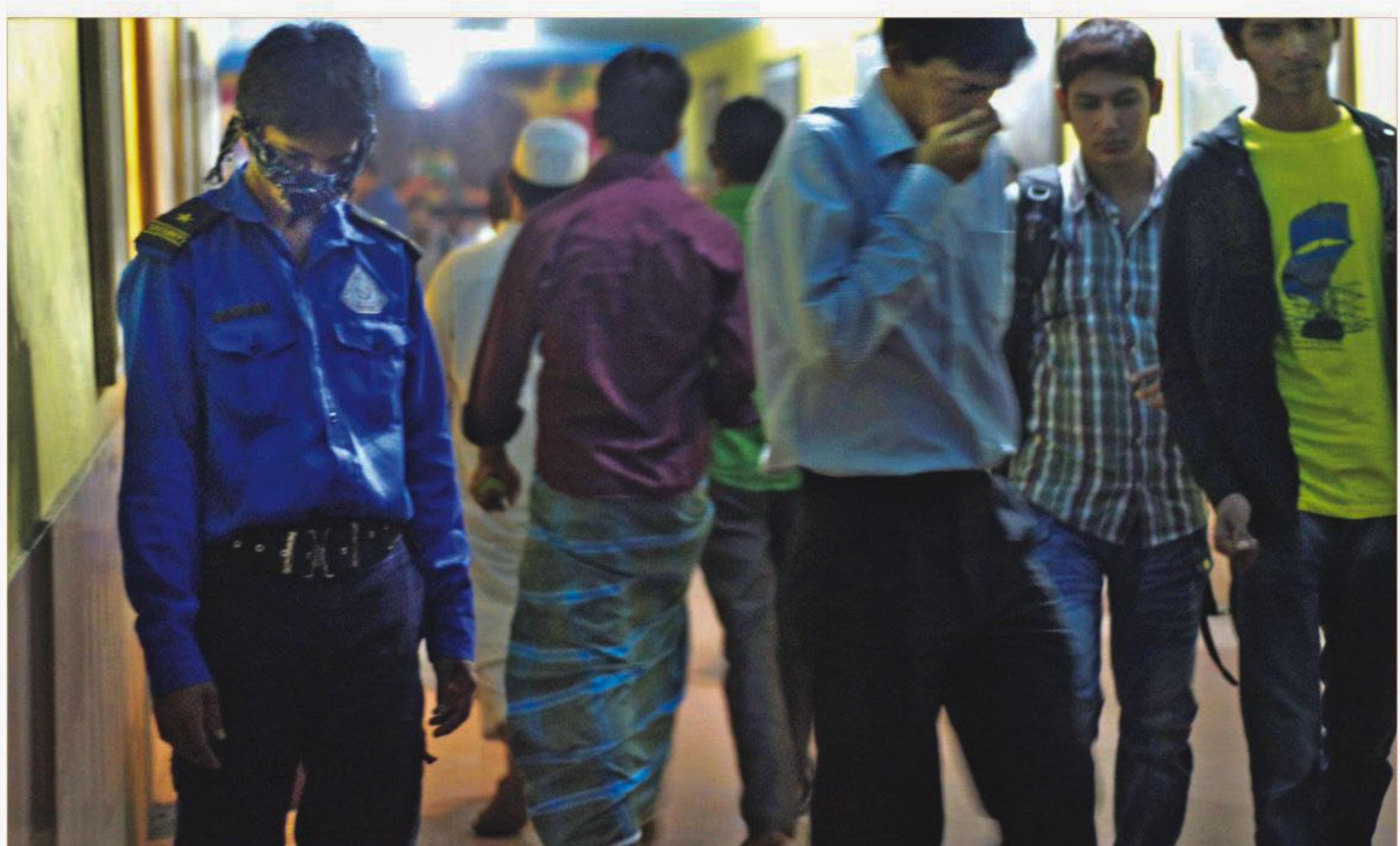
Pedestrians are forced to cover their noses while crossing the Karwan Bazar underpass in the capital. Though the underpass was renovated a few years ago, poor maintenance has left it all dusty, dirty and stinky again. The photo was taken yesterday.

STAFF CORRESPONDENT Bangladesh Food Safety Authority will be formed in a week or two, Food Minister Quamrul Islam said yesterday, boosting optimism that food adulterators would be brought to book. "The process to appoint a chairman and four members [of the authority] is underway," he told a workshop at the city's Cirdap auditorium. The food ministry in association with Food and Agriculture Organization (FAO) organised the event on "Institutionalisation of Food Safety in Bangladesh". Quamrul said all the 13 line ministries will coordinate on food safety to ensure safety at all levels, including production, import, processing, stock, supply, marketing, transportation and sale of food. The minister had earlier said implementation of the Food Safety Act, 2013 would take two to three years. He, however, did not specify a timeframe for finalising the regulations, which is essential to enforce the law. Consumers have long been seriously concerned about