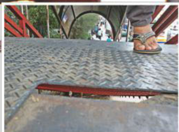
A pedestrian stepping over a sharp edge of the staircase which could have inflicted gashes on his leg on the dilapidated footbridge at Farmgate, near The Daily Star Centre, in the capital. The Dhaka North City Corporation has fully opened it to the public after partial repairs, also leaving large gaps like the one here, inset, on the landings where pedestrians may misstep anytime. The photo was taken on Tuesday.