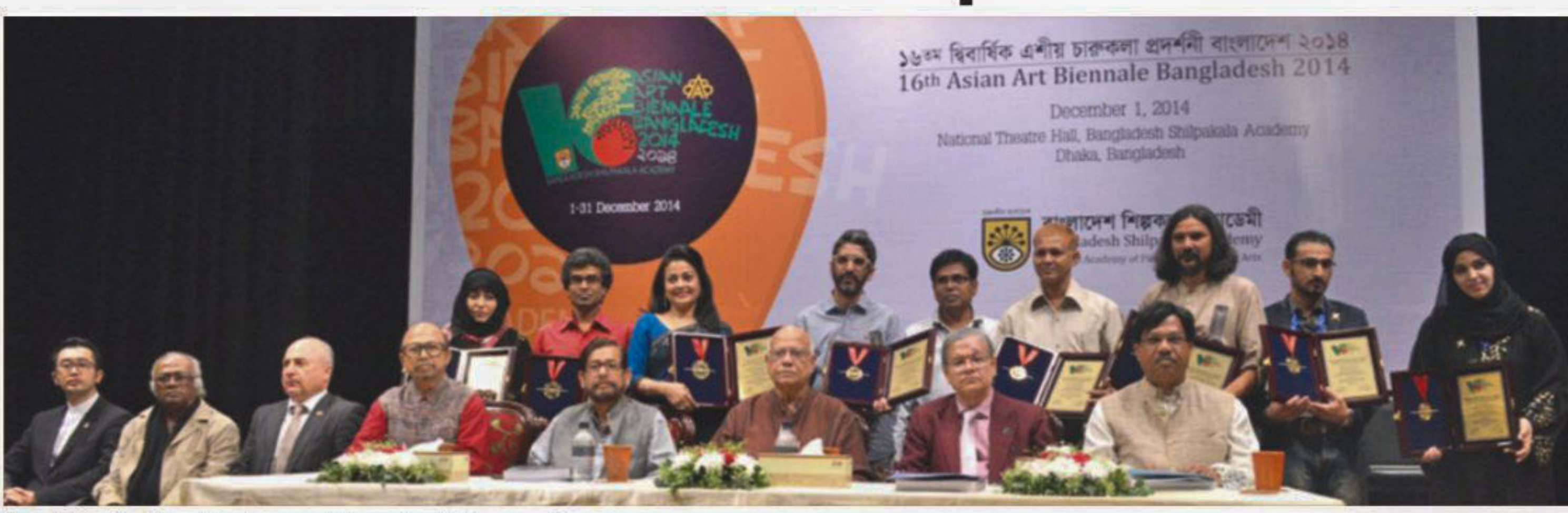
Guests with the winning participants at the opening ceremony.