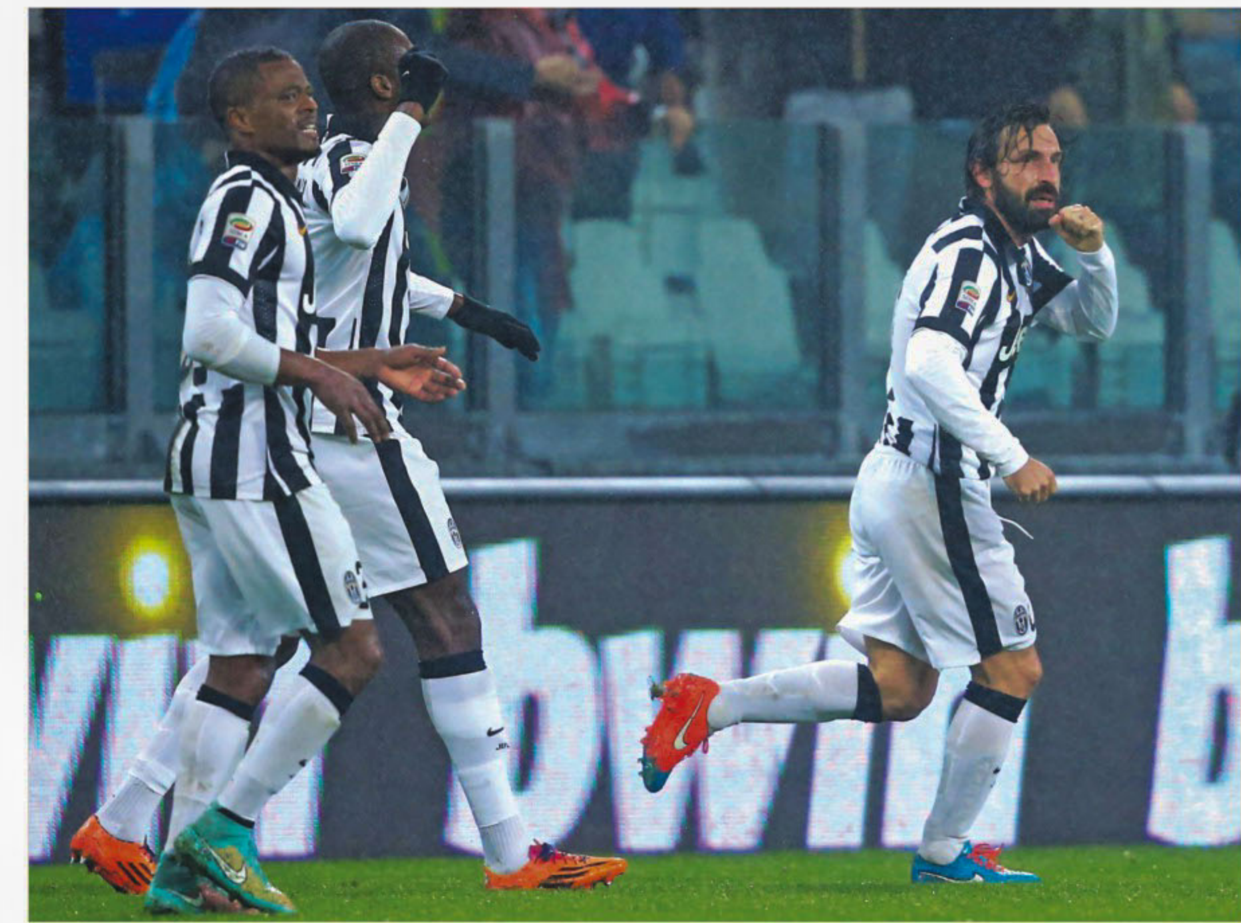
Juventus star Andrea Pirlo (R) celebrates his 93rd minute winning goal against Torino during their Serie A derby at the Stadio Olimpico on Sunday.

Feb. 8 - India v Australia, Adelaide Feb. 9 - South Africa v Sri Lanka, Christchurch; New Zealand v Zimbabwe, Christchurch; England v West Indies, Sydney; Pakistan v Bangladesh, Sydney Feb. 10 - Ireland v Scotland, Sydney; India v Afghanistan, Adelaide Feb. 11 - New Zealand v South Africa, Christchurch; Sri Lanka v Zimbabwe, Christchurch; Australia v United Arab Emirates, Melbourne; England v Pakistan, Sydney Feb. 12 - West Indies v Scotland, Sydney; Ireland v Bangladesh, Sydney Feb. 13 - Afghanistan v United Arab Emirates, Melbourne