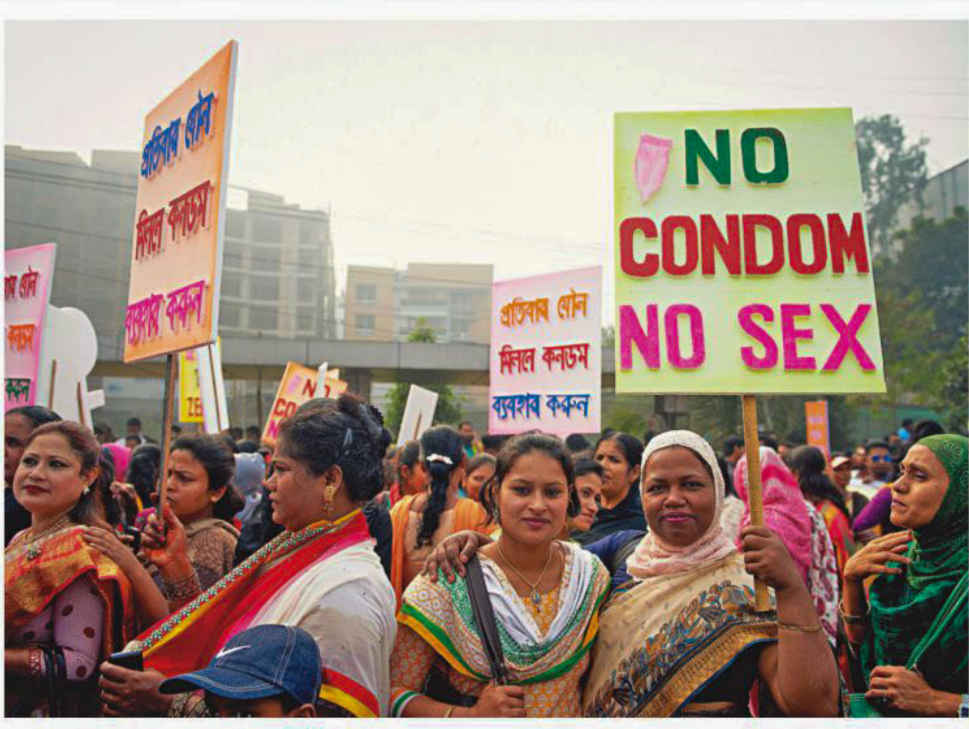
The Directorate General of Health Services brings out a procession on Manik Mia Avenue in the capital marking World Aids Day yesterday.