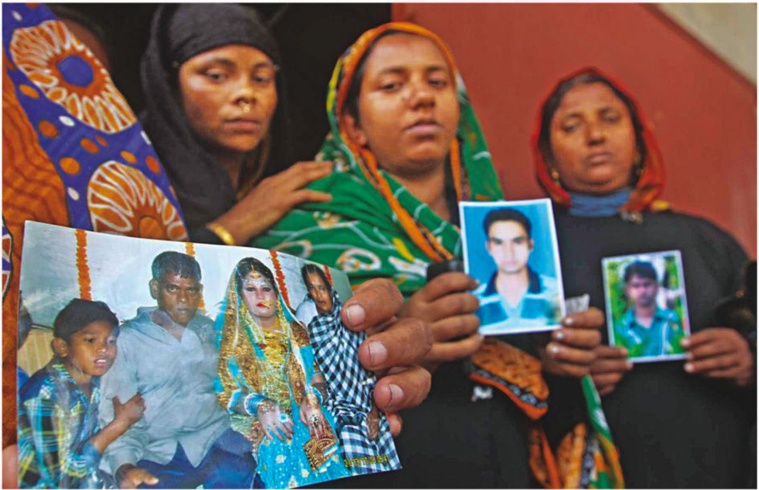
With photos of the missing fishermen, relatives gather at the Majhirghat in Chittagong yesterday hoping for news of their loved ones. MV Bandhan went down in the Bay early Friday with 26 crew members.