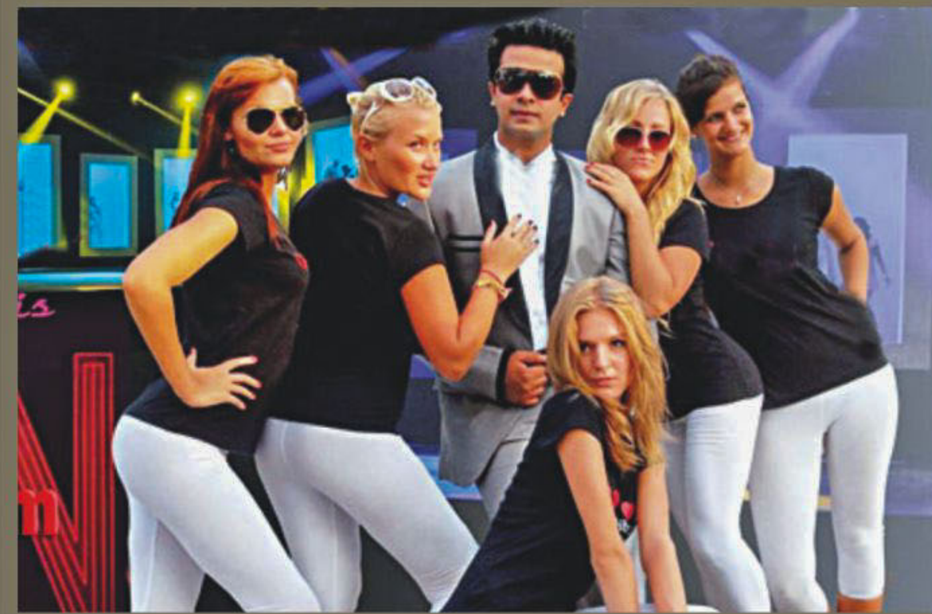
FIND FIVE DIFFERENCES BETWEEN THE TWO PICTURES FROM "MY NAME IS KHAN"

Send "ALL FOUR" answers to showbiz.tds@gmail.com Winners will receive QUEEN SPA ROOM GIFT VOUCHER courtesy of Queen Bella ALL 4 QUESTIONS MUST BE ANSWERED CORRECTLY