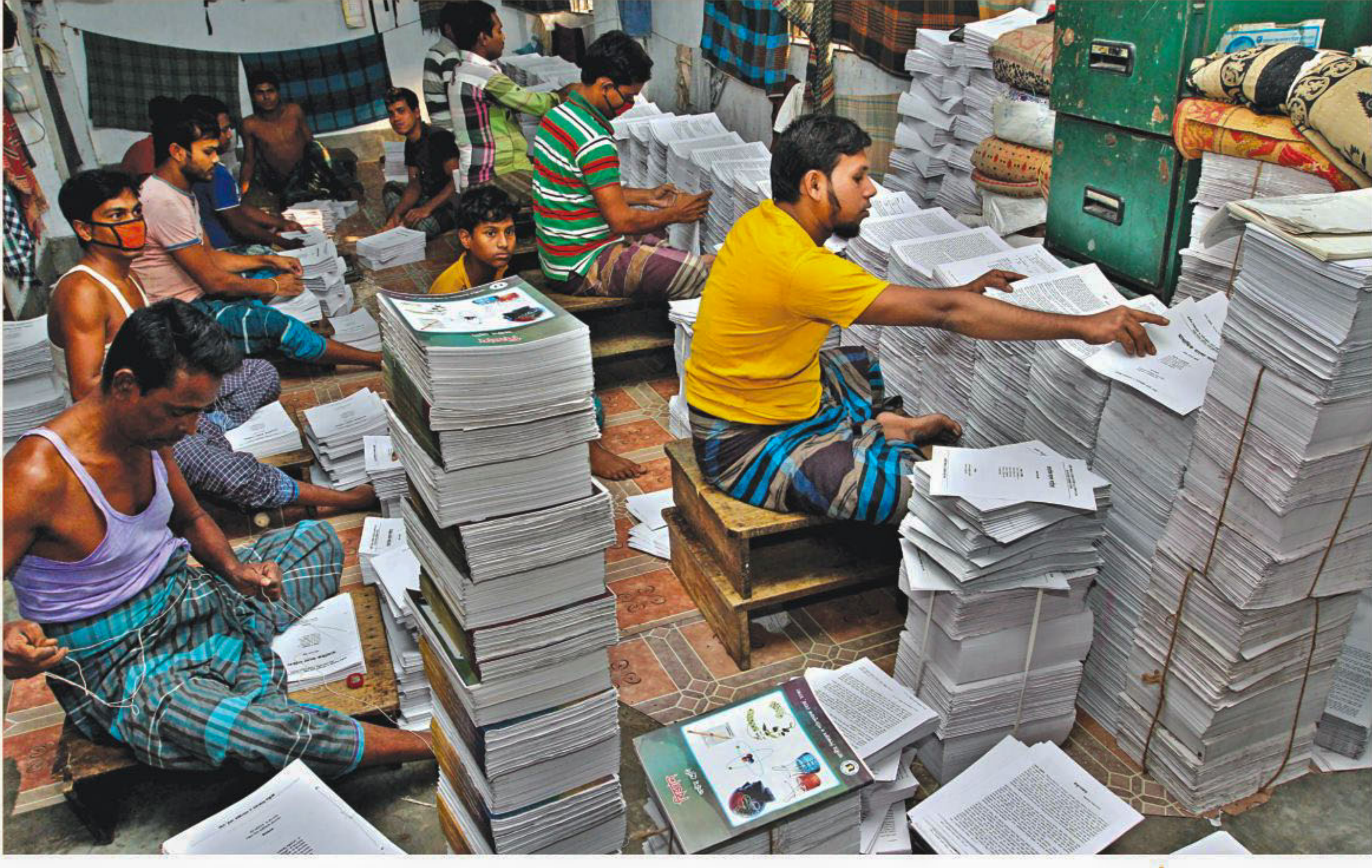
Textbooks for school children being prepared at Bangla Bazar of Old Dhaka for shipment. The government is on schedule to get the books to the children on time this year.