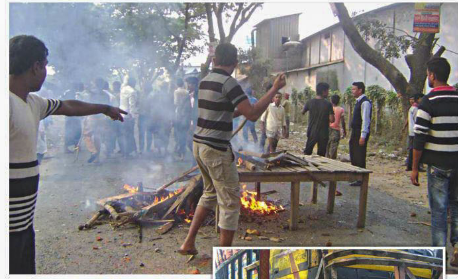
Locals burn furniture and wood on Dhaka-Dinajpur highway to block it at Phulbari. Inset, the motorbike of the BGB jawans crushed under the truck.