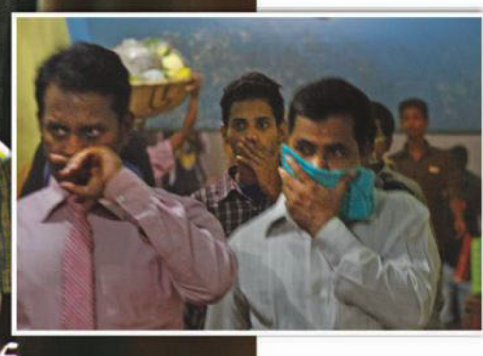
Pedestrians in the poorly lit, stinky and dusty underpass at Karwan Bazar in Dhaka yesterday. Some using handkerchiefs over their mouths, inset, while passing through. Vendors occupy the pavement leading to the footbridge at Farmgate and a hawker sitting on a footbridge, right.