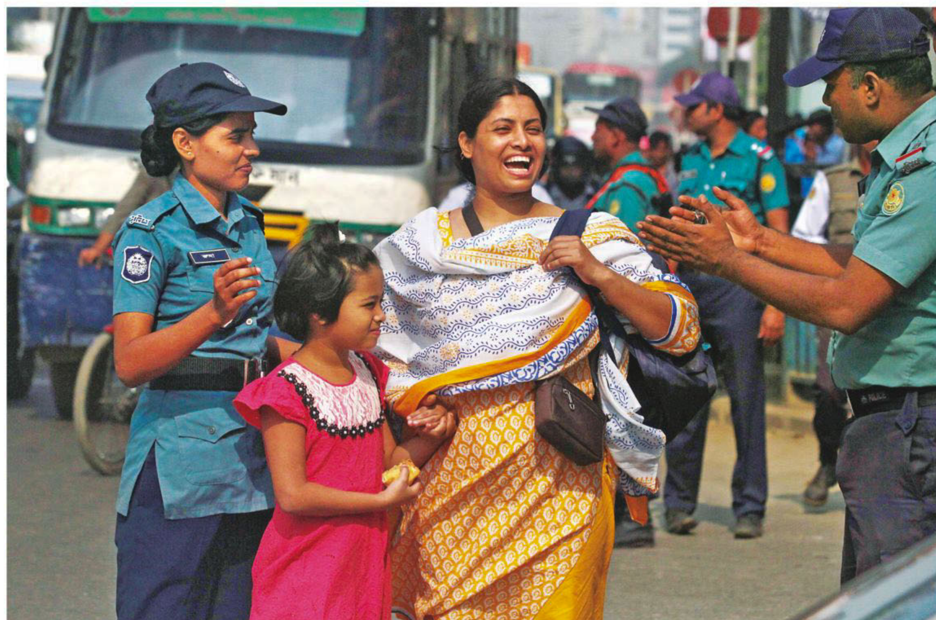
Two cops talking to a mother after she had jaywalked on Kazi Nazrul Islam Avenue with her child. A crackdown on jaywalking began on the avenue yesterday, and 331 pedestrians were fined on the first day. More photos on page 2.