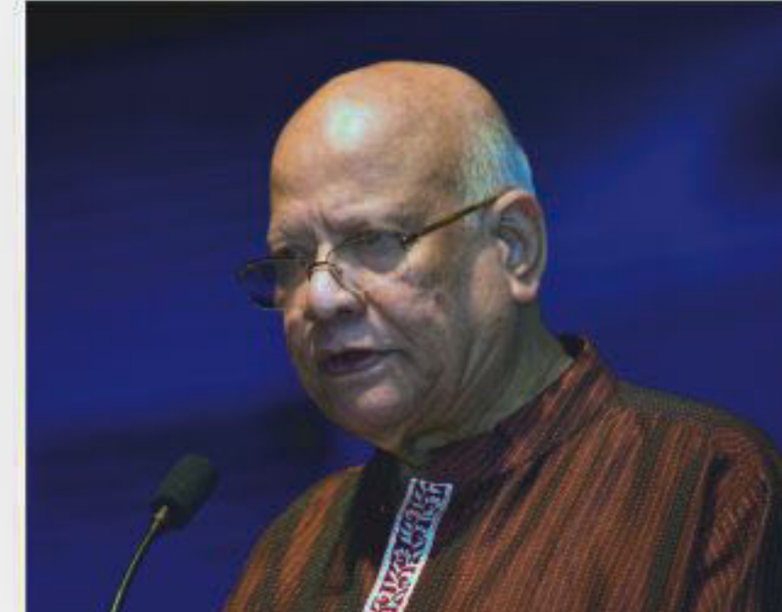
Abul Maal Abdul Muhith Honourable Minister of Finance Government of the People's Republic of Bangladesh This is a happy occasion for me. In the last five years, through a continuous export-led growth, the level of exports have more than doubled. The strength lies in the unique ability of the energetic people of this country, who take a quarter manufactured product and add value to it. Our labour force is intelligent, resilient and adaptive to change. I believe the capacity to add value to a half manufactured product should be the policy of our country. The five awardees that we have seen tonight, their journey from humble business ventures to great levels of business, is the story for everyone to follow. The HSBC award that they have received tonight is a symbol of their journey, a recognition by the country for all their efforts. Congratulations to them and their great efforts.