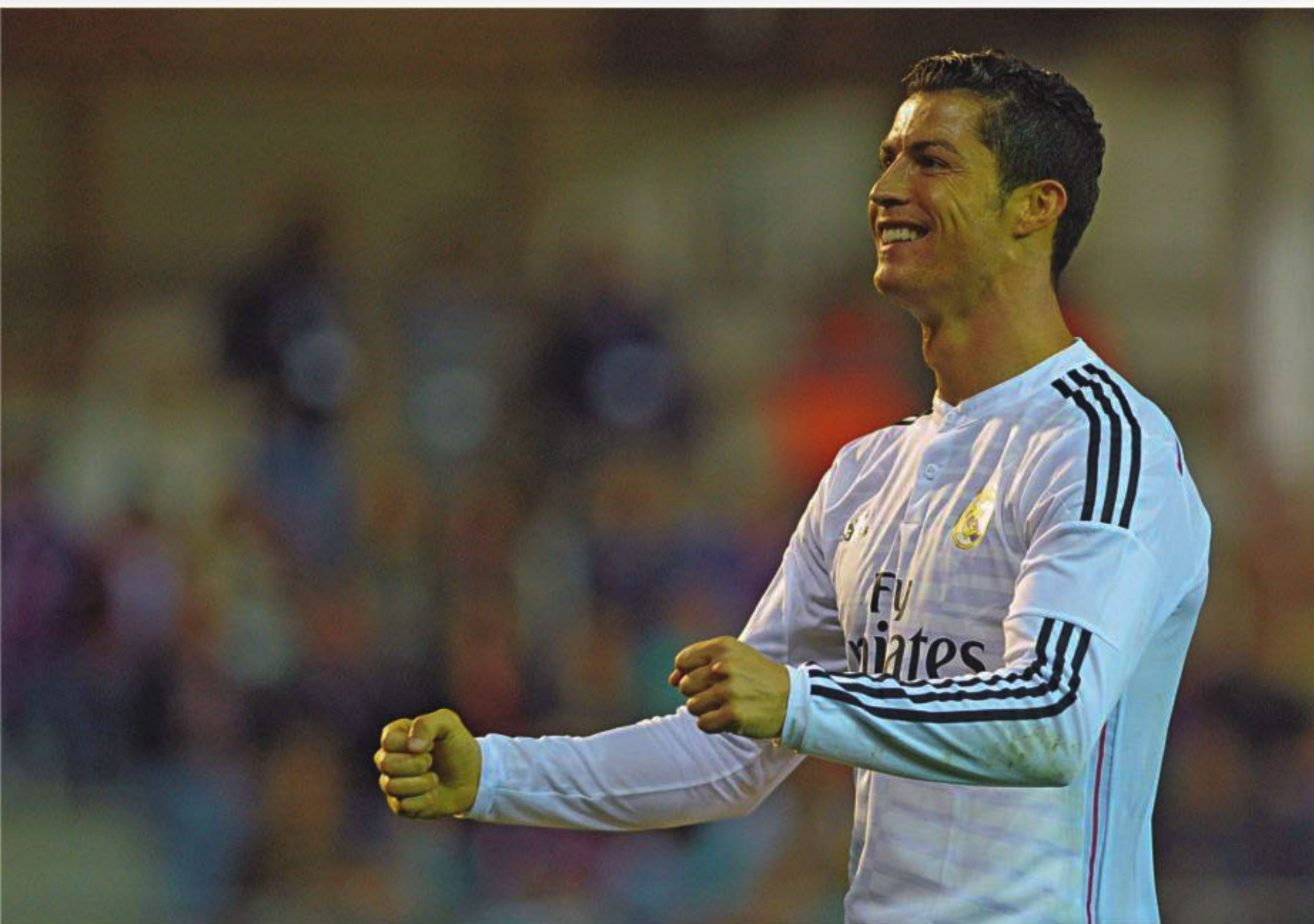
Real Madrid superstar Cristiano Ronaldo celebrates one of his two goals against Eibar during their Primera Liga encounter at the Ipurua Stadium yesterday.