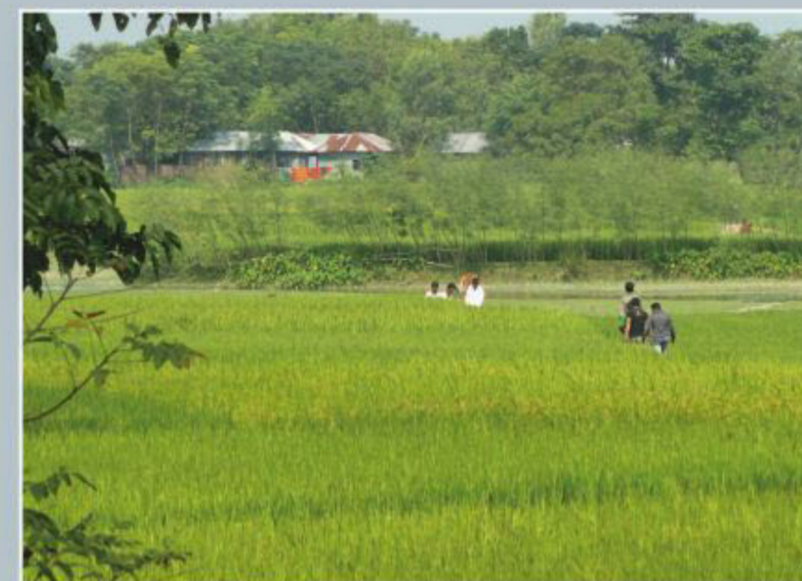
The rather pretty walkway, left , through the bamboo bush at Chawratari in Mogholhat of Lalmonirhat is actually a path made by Phensidyle smugglers. They smuggle the contraband into Bangladesh from India, where the cough syrup is legal. Along the border, there are factories, middle , that cater the addicts of Bangladesh. The traffickers just walk to the factories and return with sack full of Phensidyle, top right , and addicts of Bangladesh walk to India to get their fixer cheaply.