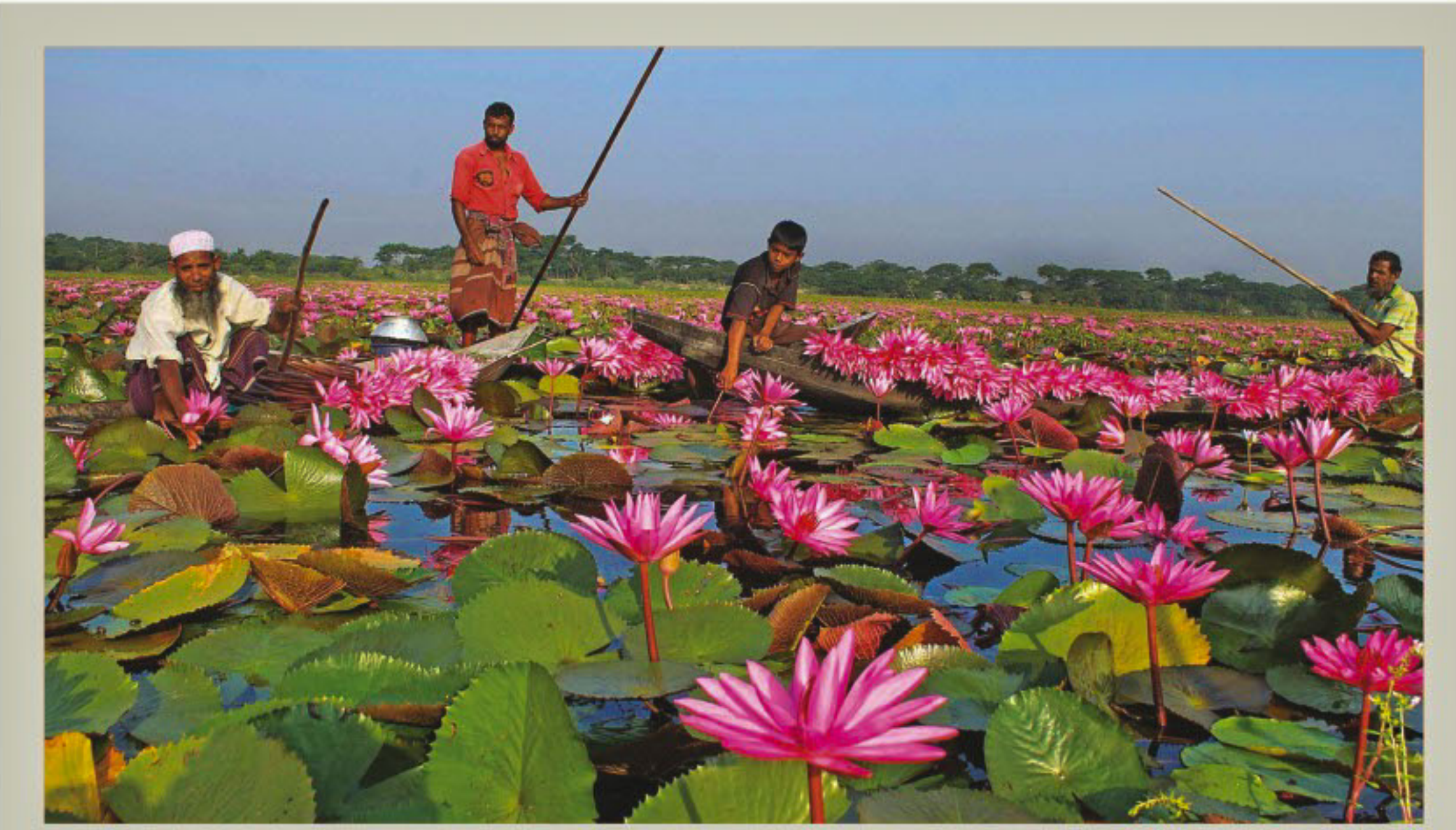
Water lilies are in full bloom on the Shaplar Beel in Agailjhara upazila of Barisal. The national flower is seen miles across the lake, which attracts tourists from nearby districts. Some collect the flower to sell in markets. The photo was taken yesterday.

STAFF CORRESPONDENT Malaysian authorities yesterday remanded 24 foreigners, including 21 Bangladeshis, for trying to enter the country illegally. Officials at Malaysian Maritime Enforcement Agency (MMEA) on Saturday night detained 21 Bangladeshis, two Indonesians and an Afghan from near the country's southern Tanjung Sepat area under Selenagor province, Malaysian English Daily The Star reported yesterday. The detainees were entering the country by a tugboat from Indonesia. SEE PAGE 2 COL 6