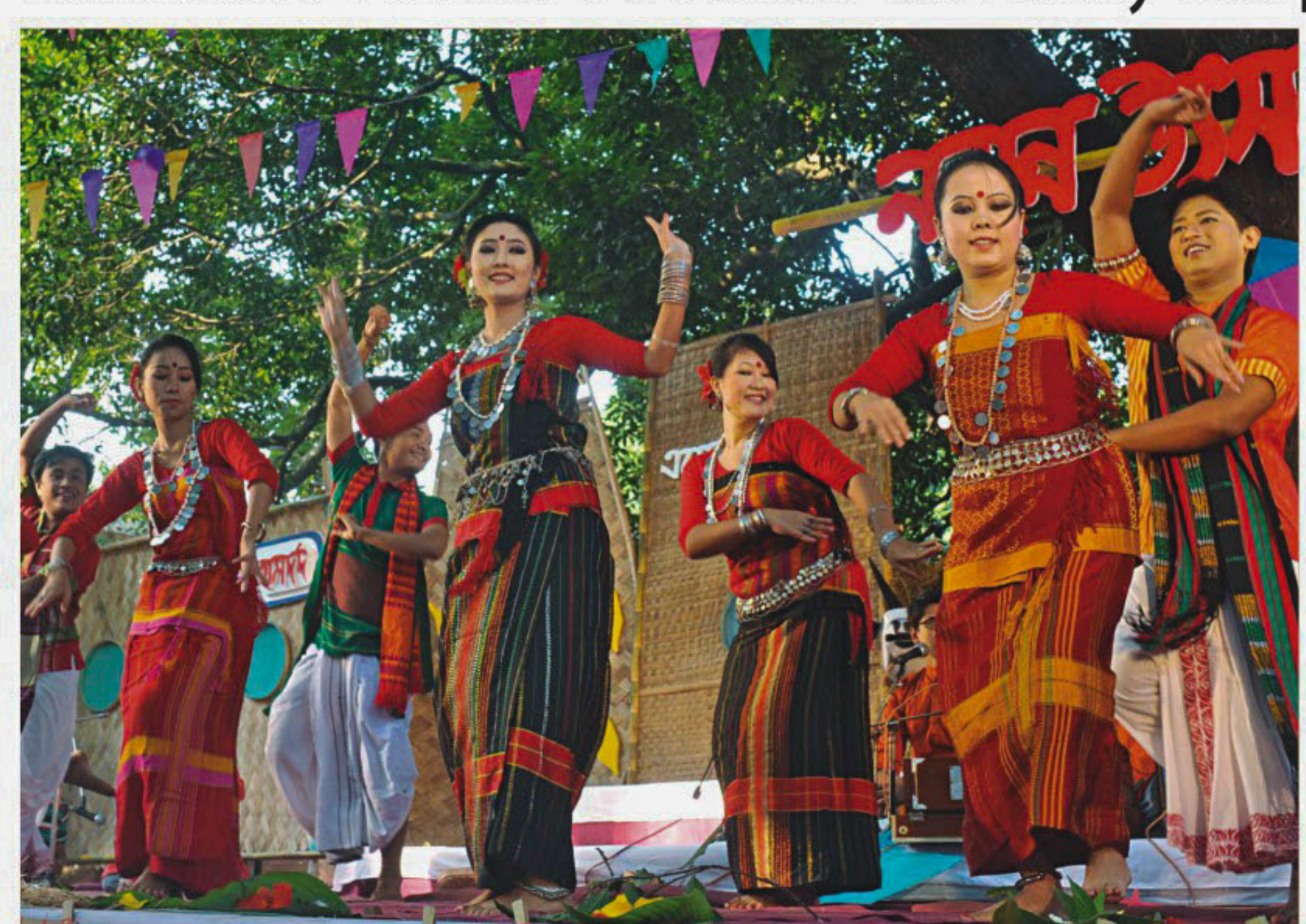
The festival gave city dwellers a unique opportunity to spend their weekly holiday joyously.