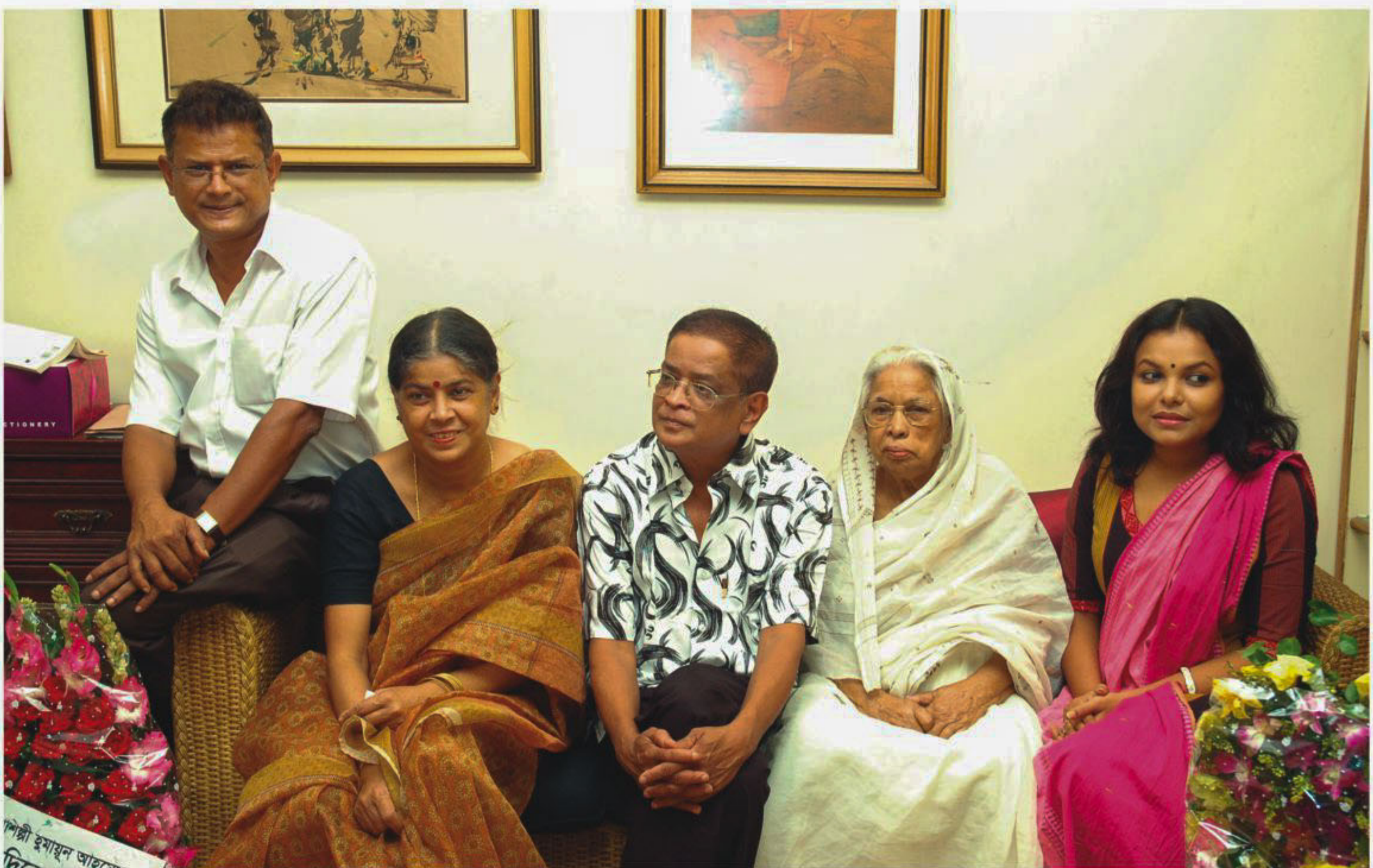
Humayun Ahmed on one of his birthdays; his family feels the vacuum of his loss.

Channel i to hold Humayun Mela today Channel i is holding a daylong Humayun Mela today at the Channel i premises marking legendary litterateur Humayun Ahmed's birth anniversary. The fair will include music performances, recitation, dance, interview, painting, discussion in memory of Ahmed and staging of play. The channel will air the fair live 11am to 2pm.