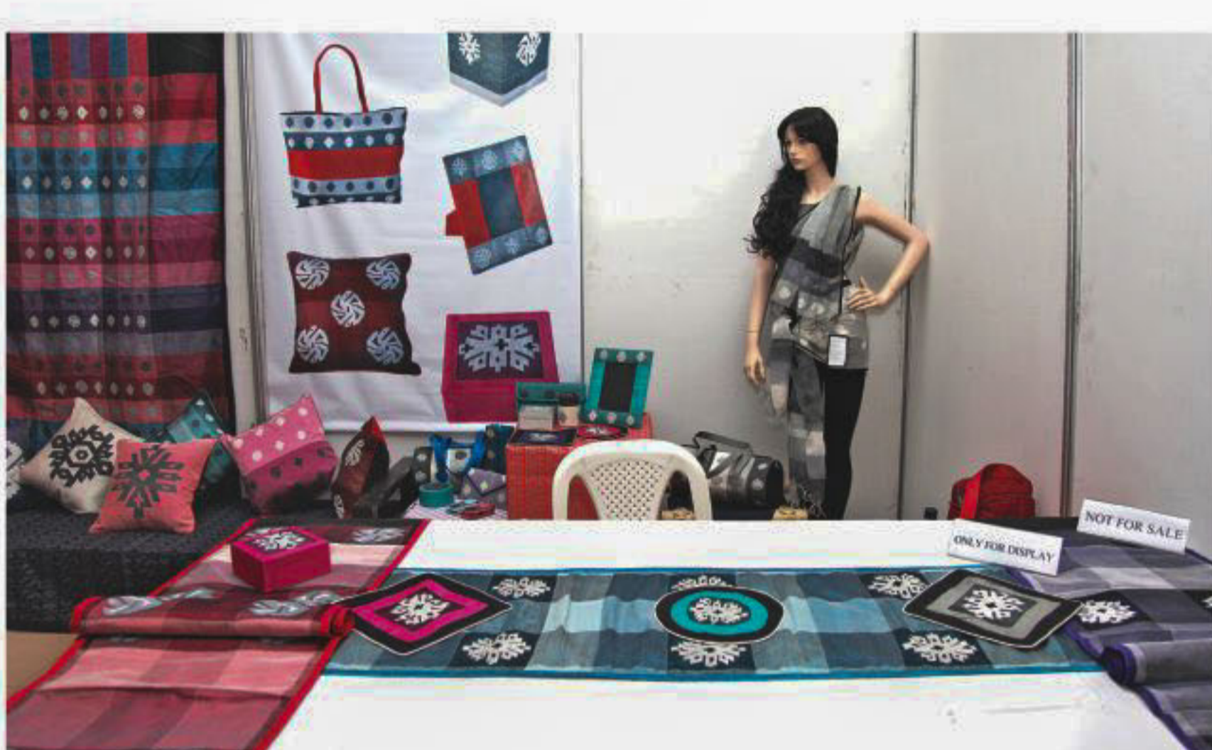
A three-day exhibition on Jamdani weavers, specialists and designers is closing today at the National Art Gallery auditorium of Bangladesh Shilpakala Academy. The exhibition, organised jointly by Bangladesh National Commission for UNESCO and Korean National Commission for UNESCO, is a part of the project 'Safeguarding 'Jamdani'—the Intangible Cultural Heritage from Bangladesh and Promoting Creative Economy".

It is carved out of a single block of cedar wood into a box-like shape with three hollow chambers named after body-parts: pet (stomach), chhaati (chest) and magaj (brain). It is thought that the "ang" in the word "sarangi" refers to the human body whilst "sar" means head, with the whole word colloquially meaning an instrument that can perform in any style - literally, from head to toe.