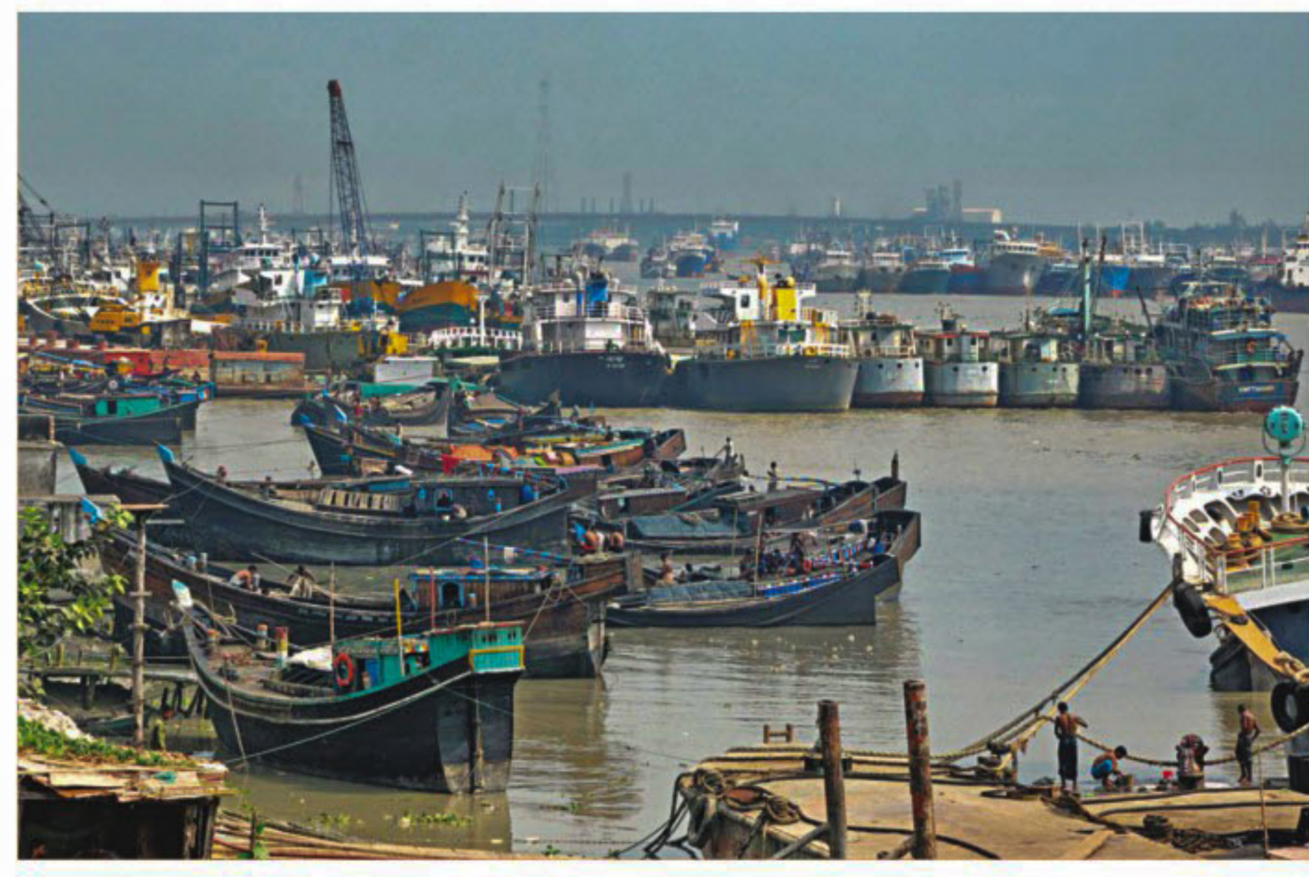
Lighterage vessels sit idle at Karnaphuli river yesterday after water transport workers called an indefinite strike on November 8.

DWAIPAYAN BARIUA, Chittagong Water transport workers have withdrawn their strike, which had paralysed freight transfer through inland waterways, after a fruitful meeting with Shipping Minister Shajahan Khan yesterday evening. Shah Alam, president of the Bangladesh Noutjan Sramik Federation, a platform of seven workers' organisations, told The Daily Star that the strike was called off as the minister has assured them of meeting their demands. The workers have subsequently been asked to resume operation by yesterday night. The strike, which began on Saturday morning following reports on Friday night of seven missing workers after an ambush on a fertiliser-laden lighter vessel, left hundreds of thousands of tonnes of imported goods stuck at mid-sea. The workers were firm on their demands, which include safety assurance during transit, search for missing workers, punitive actions for those responsible for Friday night's incident and elimination of scope for extortion in inland waterways. It was decided at yesterday's meeting that efforts would be made to rescue the missing crew at the earliest, arrest the miscreants within seven days and dispatch round-the-clock patrol to crucial spots on the waterways, Alam said.