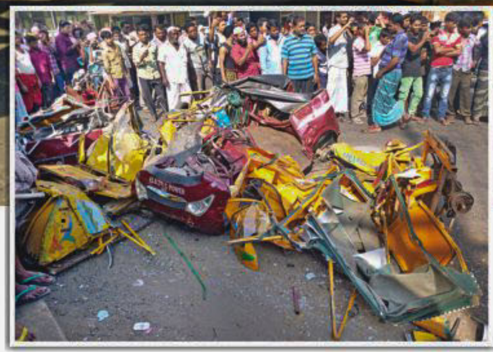
A mobile court in Feni town bulldozing an improvised three-wheeler, known as easy bike, as part of the countrywide clampdown on unfit vehicles and unlicensed drivers launched yesterday. Inset, the mangled remains of some of the 50 unfit vehicles.