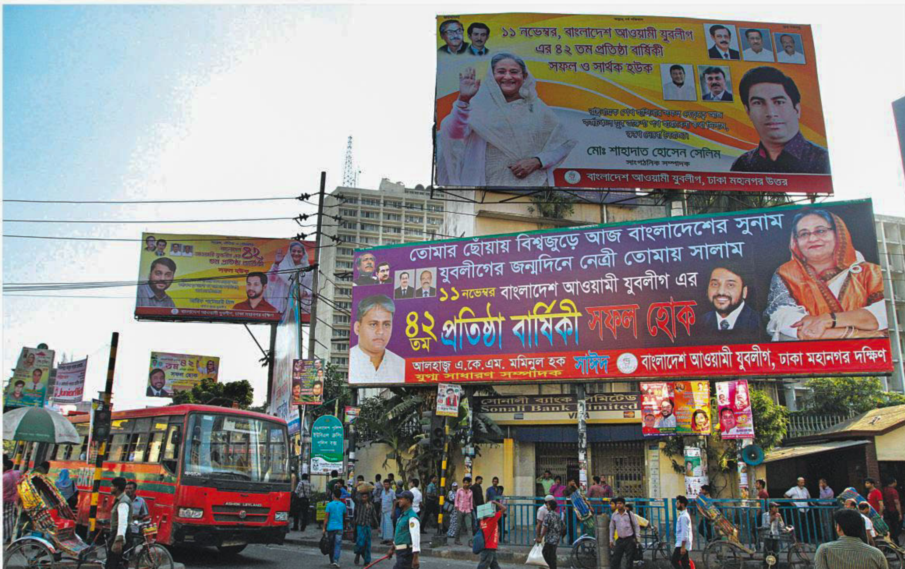
Leaders of the Jubo League, the youth wing of ruling Awami League, have put up huge banners and occupy billboards at Paltan intersection promoting themselves in the name of marking its 42nd anniversary. The photo was taken yesterday.