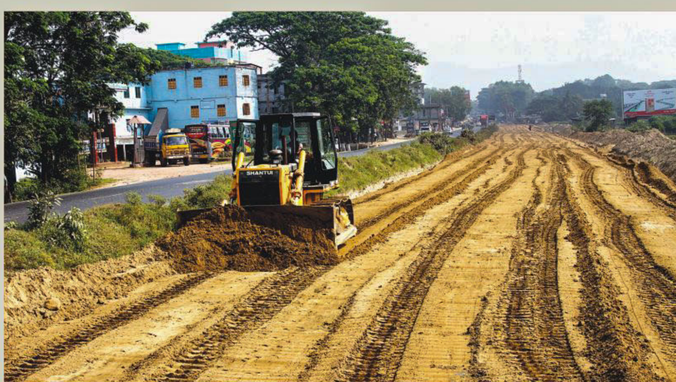
A man with a bulldozer at work at Maynamoti of Comilla yesterday. The slow going of the Dhaka-Chittagong highway expansion work picked up some pace recently.