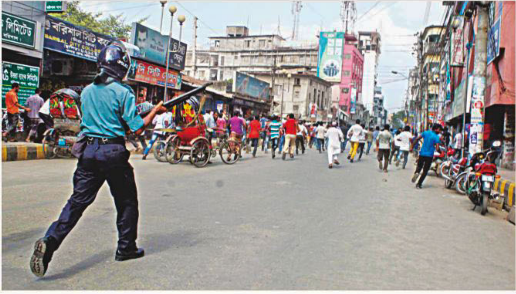
Police chase away BNP activists, who attempted to bring out a procession, from in front of the party office in Barisal city yesterday.

headquarters for yesterday to protest the government's "autocratic decision not to allow" a rally at Suhrawardy Udyan to mark "the national revolution and solidarity day." BNP Joint Secretary General Rizvi Ahmed told the press at the party's Nayapaltan central office yesterday evening that the government's "autocratic attitude" was reflected in the action of police who did not allow them to hold