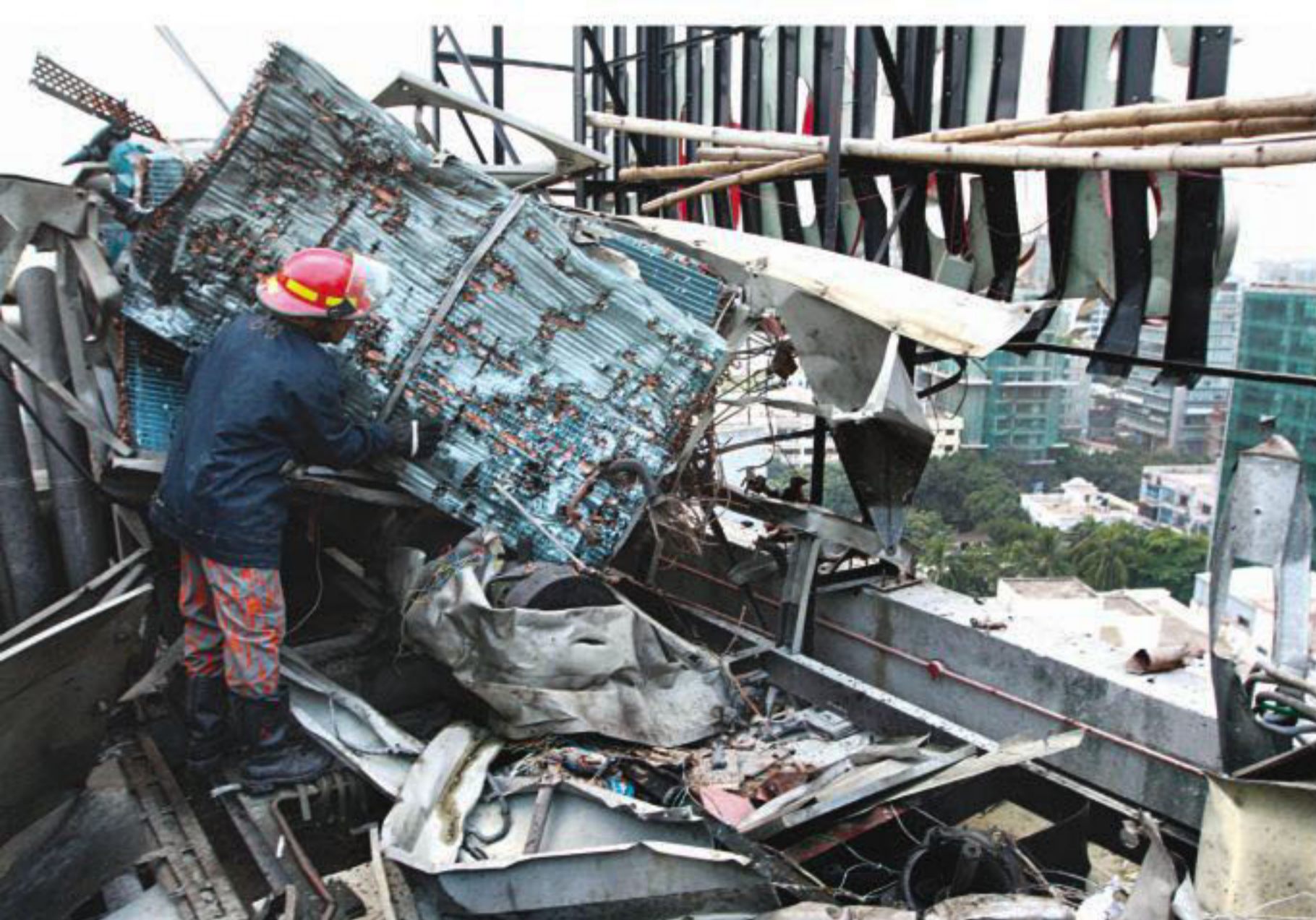
A firefighter inspects the wreckage of a Gulshan hotel where an air conditioner exploded yesterday.