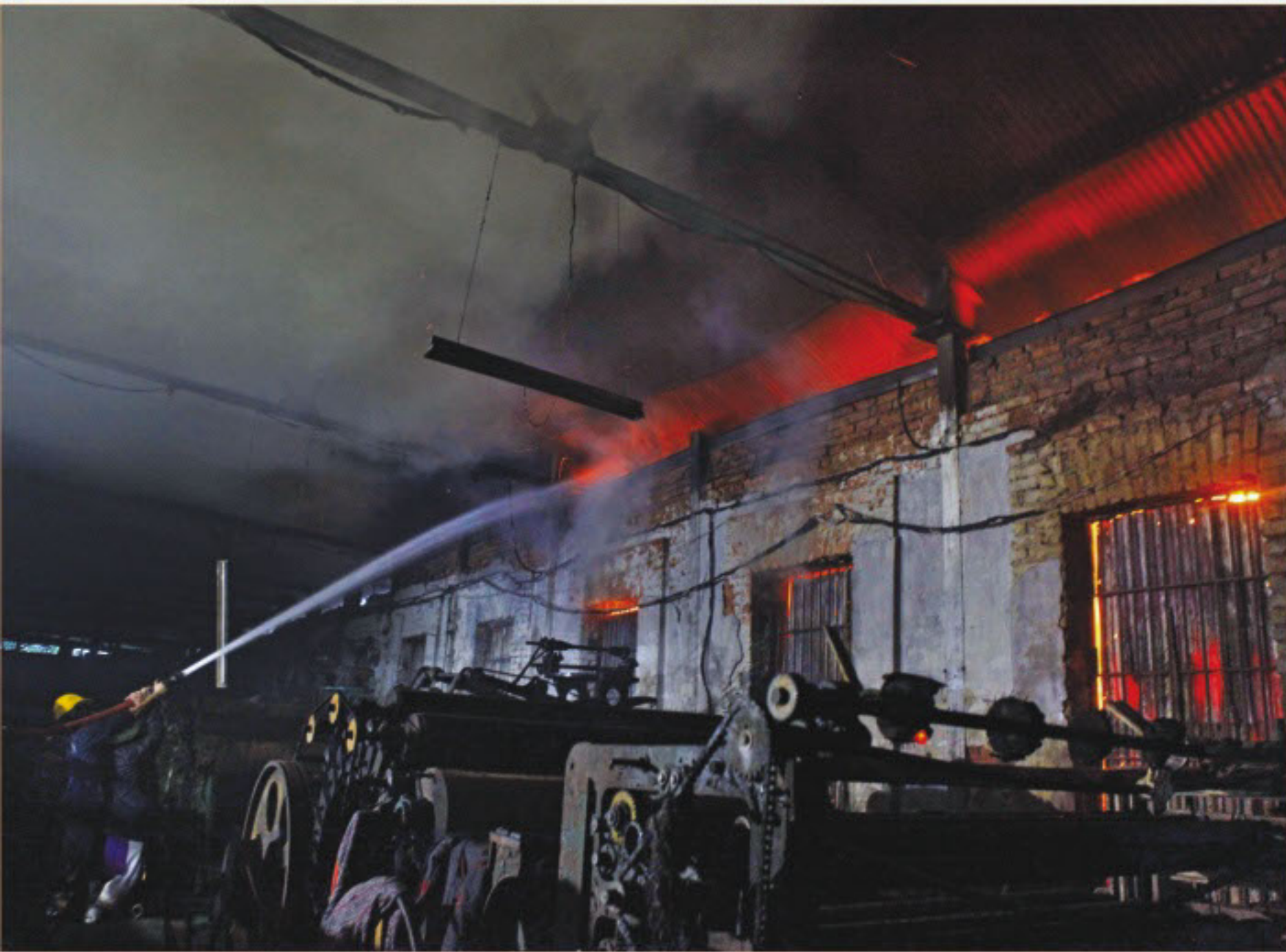
Firefighters try to douse the blaze at a factory in Old Dhaka yesterday. Story on page 2