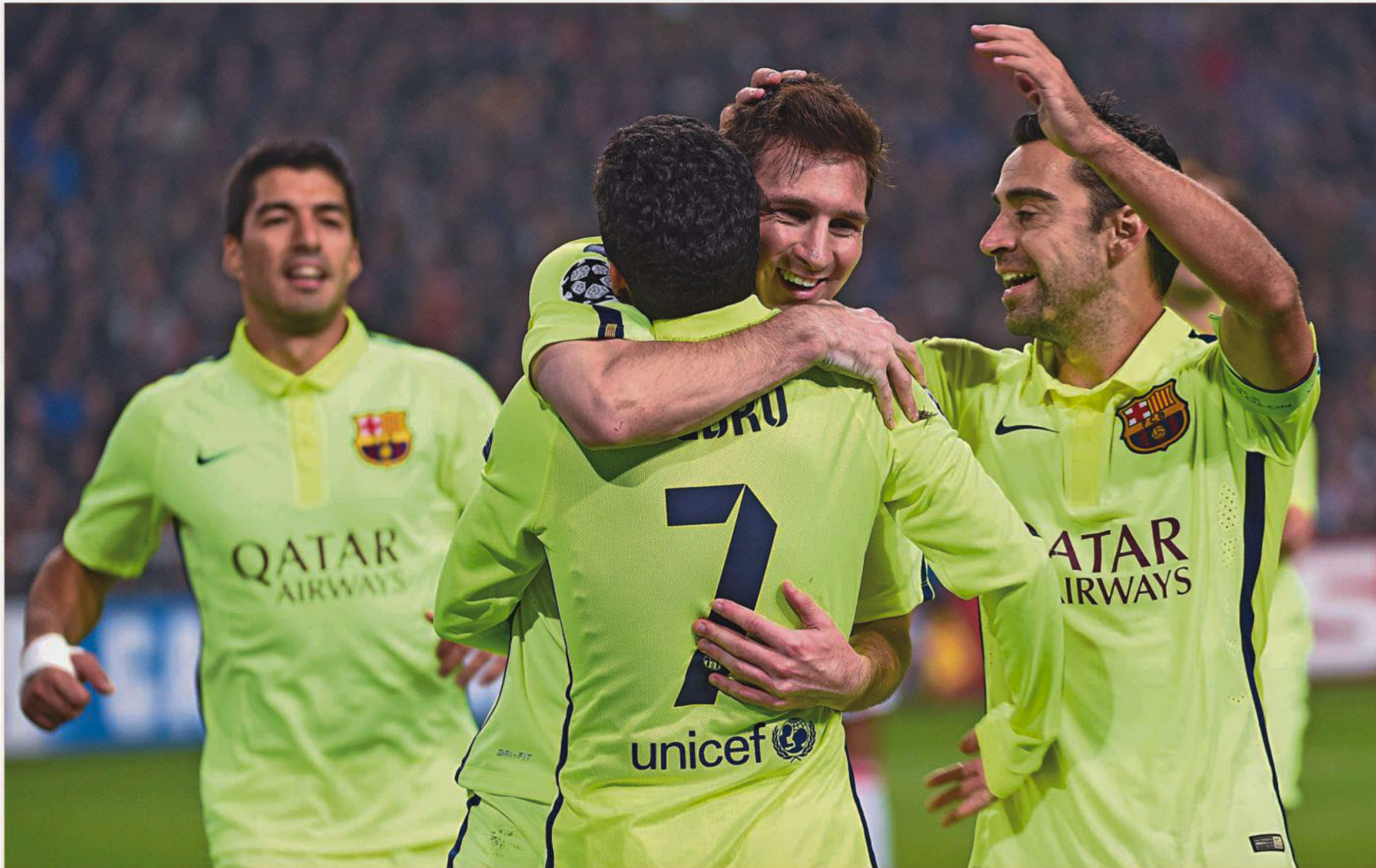
Barcelona superstar Lionel Messi (2nd from R) celebrates his second goal with teammates during their Champions League encounter against Ajax in Amsterdam on Wednesday.

Barcelona secured their place in the knockout stages by beating 10-man Ajax Amsterdam 2-0 on Wednesday. Argentina forward Messi struck in each half and Joel Veltman's 71st-minute red card completed a disappointing evening for the hosts. Messi matched Raul's Champions League record tally of 71 goals thanks to a 36th-minute header and a 76th-minute tap-in, beating Real Madrid's Cristiano Ronaldo to match Raul's mark. Barcelona lie second in Group F on nine points, one behind Paris St Germain who beat APOEL Nicosia 1-0 in Paris on Wednesday. Third-placed Ajax are still winless in Group F and remain on two points, leaving them vying with APOEL for a Europa League place. Messi's close-range header after Ajax goalkeeper Jasper Cillessen had failed to clear the ball was more than welcome for the visitors, who had given the hosts reason to believe a repeat of last season's surprising 2-1 home victory over Barcelona was on the cards. Ajax hopes were shattered, however, when Veltman was shown his second yellow card in the 71st minute. Five minutes later Messi slid in a low cross by Pedro to secure the win. Luis Suarez made his European debut for Barcelona, playing from the start alongside Messi and Neymar in Luis Enrique's dream attack but he struggled to impose himself on the game.