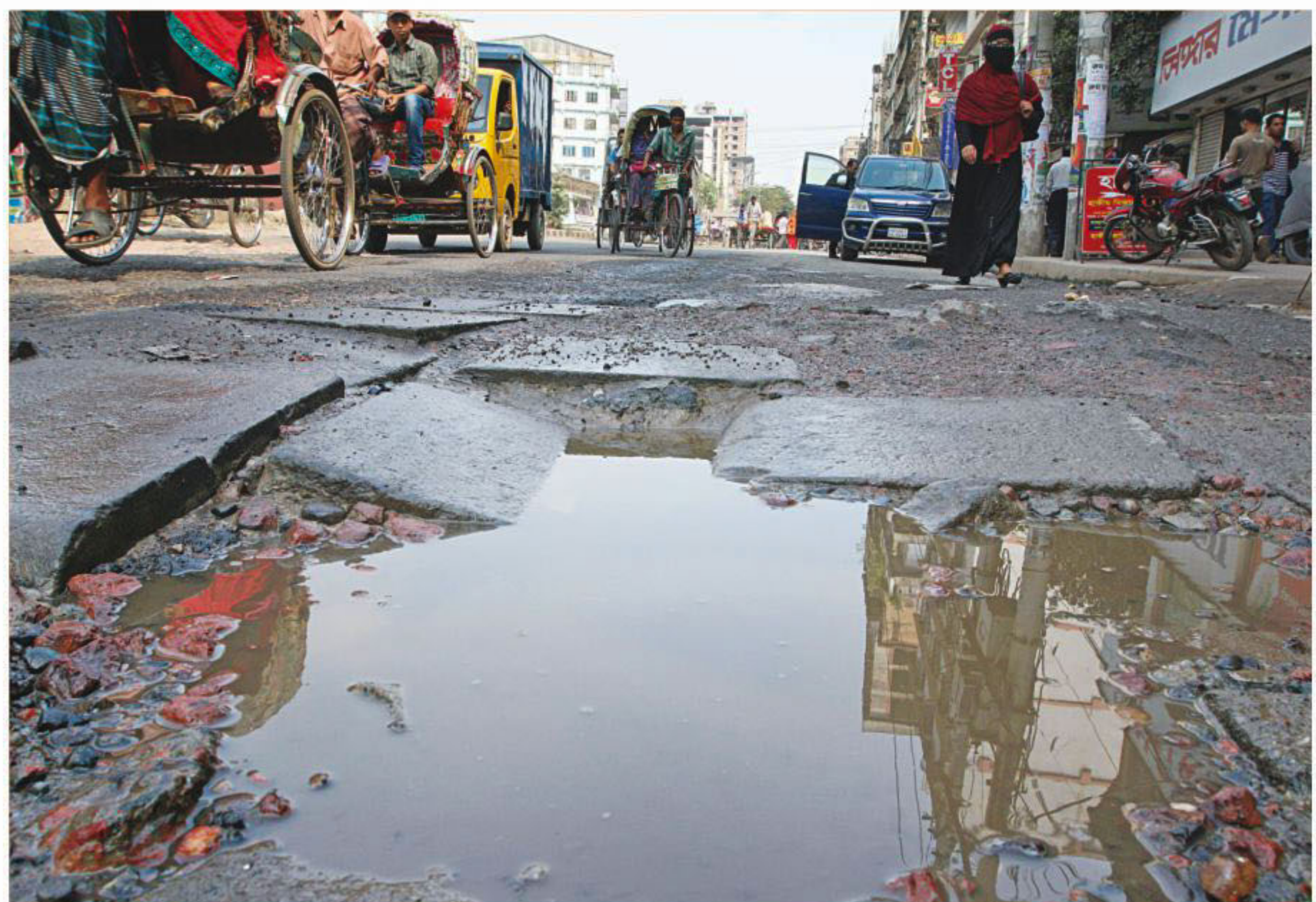
DIT road at Choudhuripara in the capital's Malibagh has been in this sorry condition with potholes filled with water for long, hampering movements of pedestrians and vehicles. The photo was taken yesterday.