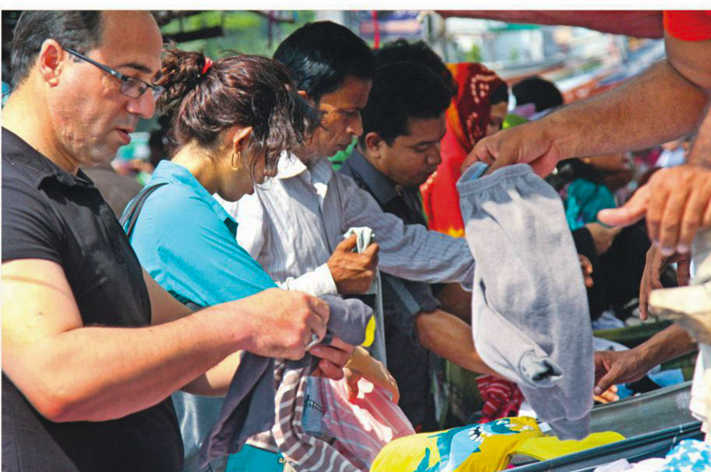
Customers busy buying goods from roadside shops on the footpath of Mirpur Road in the capital yesterday despite an ongoing hartal enforced by Jamaat-e-Islami. The photo was taken opposite Dhaka College.