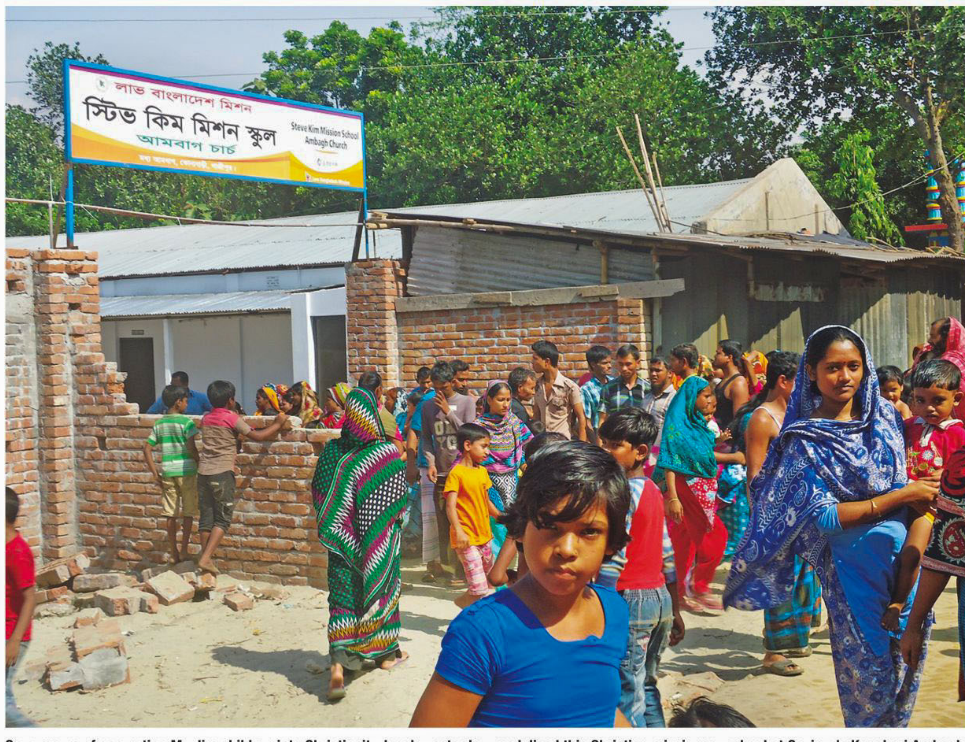
On rumours of converting Muslim children into Christianity, locals yesterday vandalised this Christian missionary school at Gazipur's Konabari Ambagh and injured at least 10 teachers and staffs of the school.

"We're aggressively pursuing an appeal to a higher court to invalidate these sweeping warrants and to force the government to return the data it has seized."