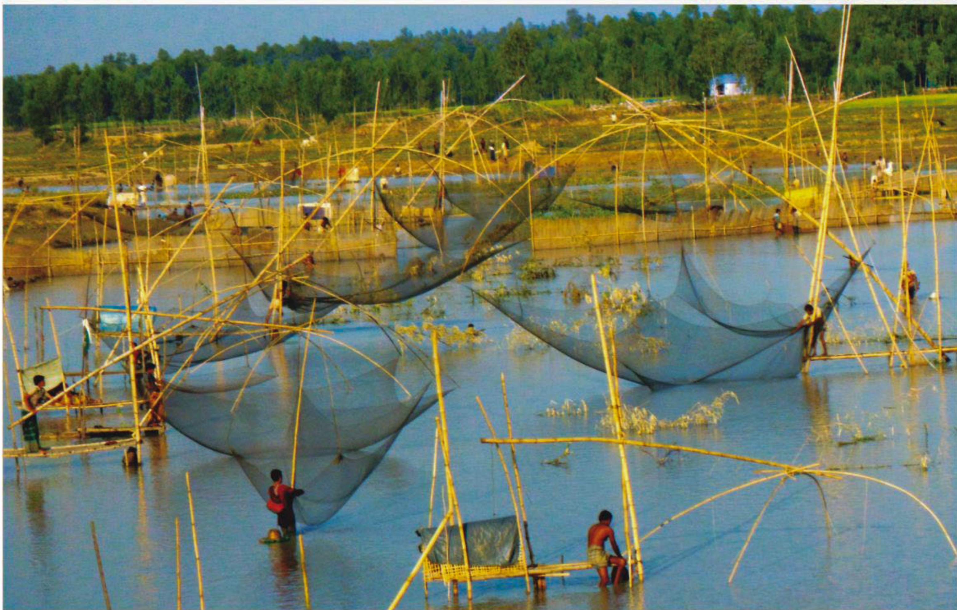
THE FISHING FEST: With water bodies drying up as winter approaches, this time of the year comes as an occasion for fishing in rural areas of Bangladesh. In the picture taken on Tuesday, people are seen catching fish in Nedar Canal in Tangail's Ghatail upazila.