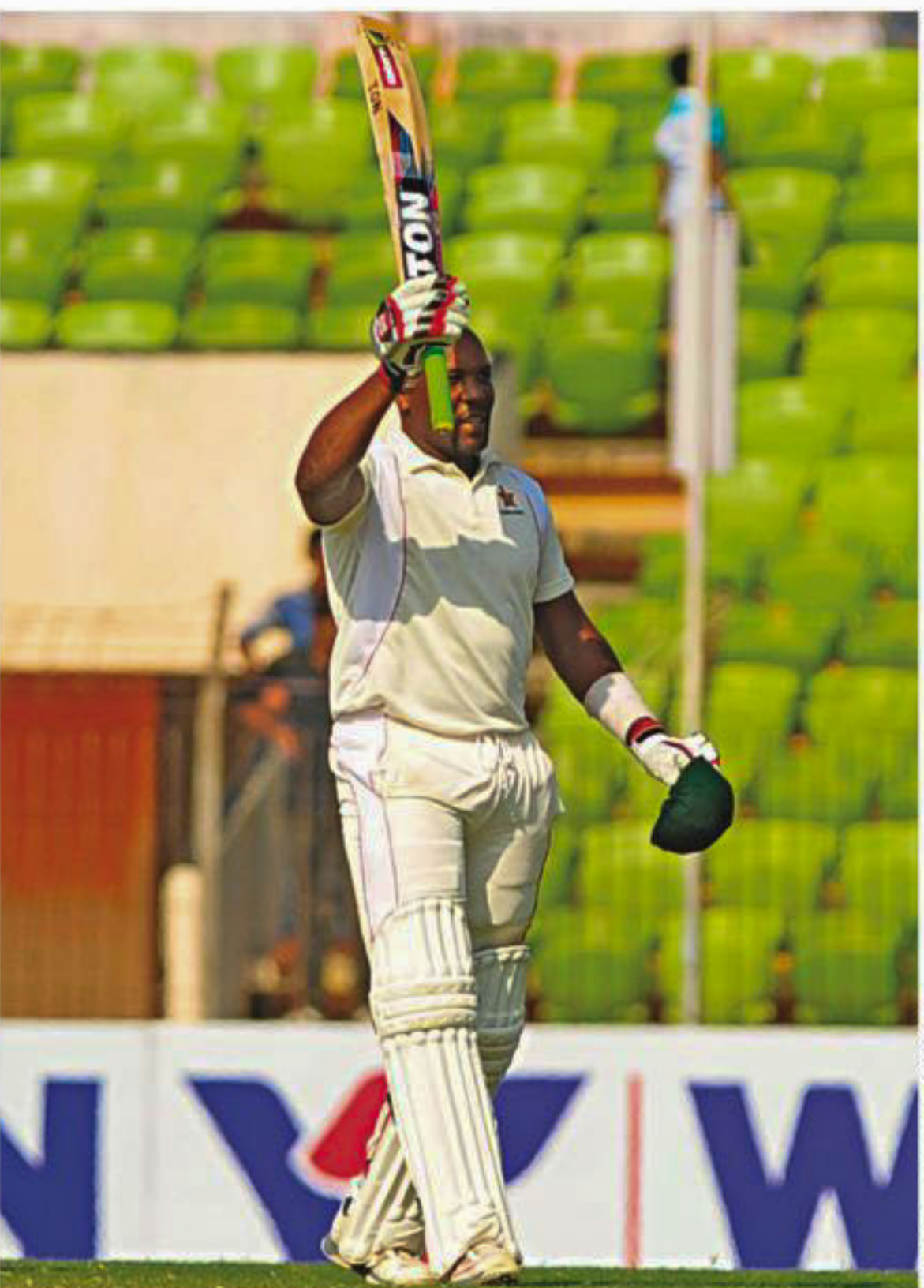
Zimbabwe batsman Hamilton Masakadza raises his bat after scoring a fine century on the third day of the second Test against Bangladesh at the Sheikh Abu Naser Stadium in Khulna yesterday. The towering right-hander remained unbeaten on 154. Story on page 14