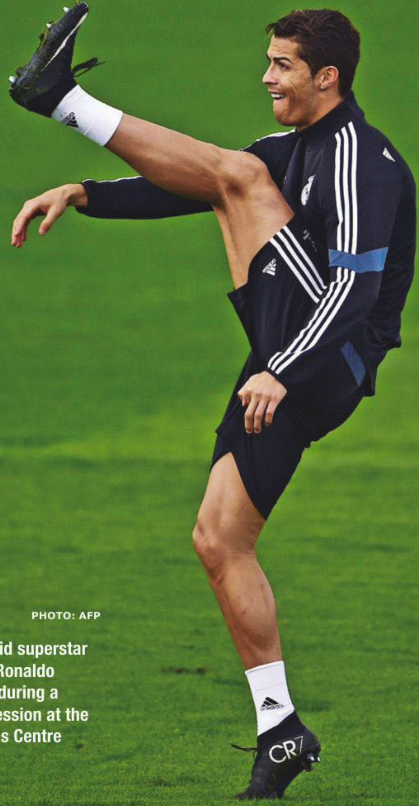
Real Madrid superstar Cristiano Ronaldo stretches during a training session at the Valdebebas Centre yesterday.

Liverpool was outclassed in the first meeting and will face an even tougher task with Madrid playing its best football since the arrival of coach Carlo Ancelotti last season.