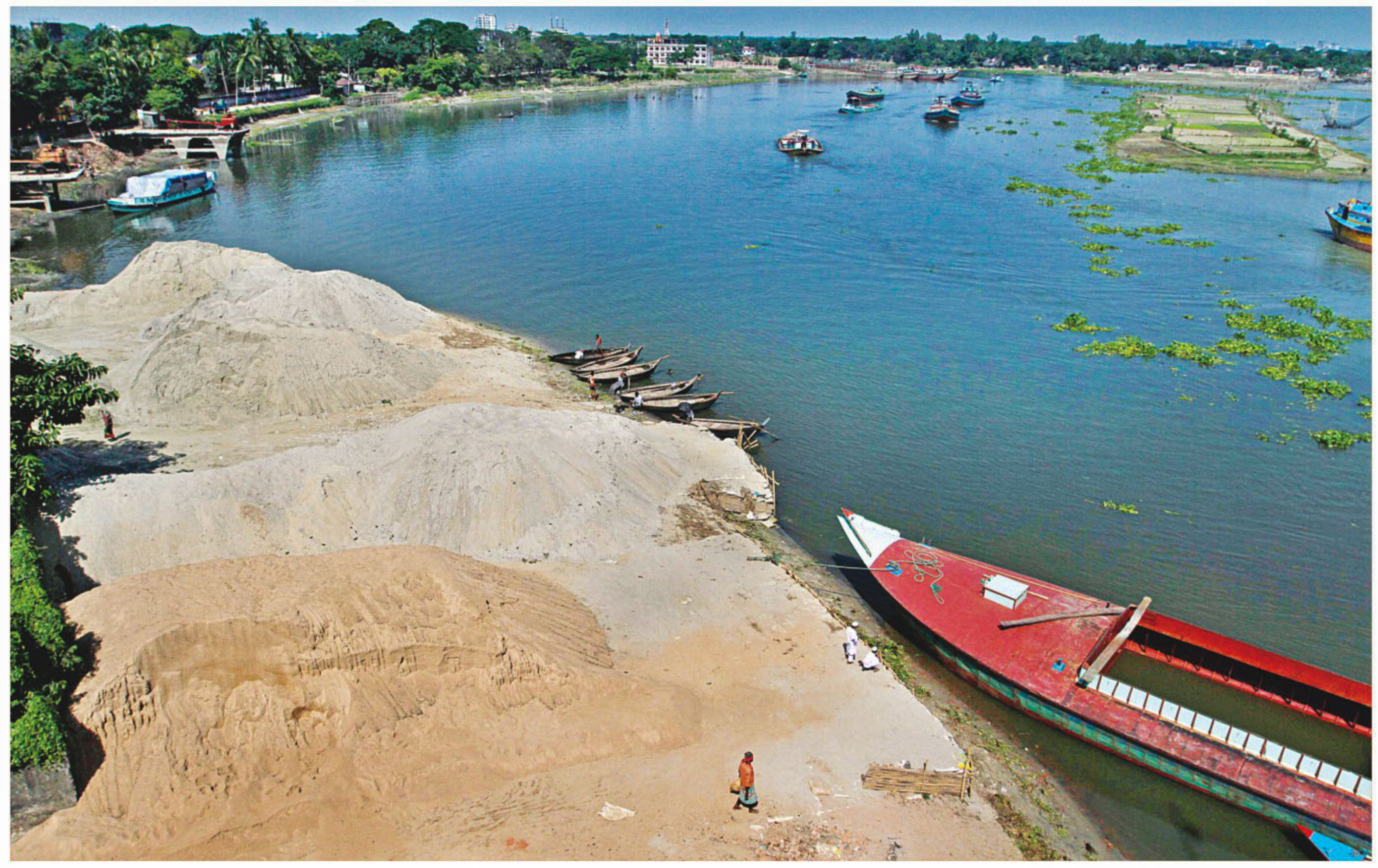
Illegal sand trading and encroachment on rivers go hand in hand in most cases in the country. The same is happening to the Shitalakkhya, near Sultana Kamal Bridge in the capital's Demra, where the site of sand trading has been expanding over the years. The musclemen behind such acts are well known--local politicians or powerful businessmen. But their might seemingly outweighs the supremacy of law. The photo was taken on Friday.