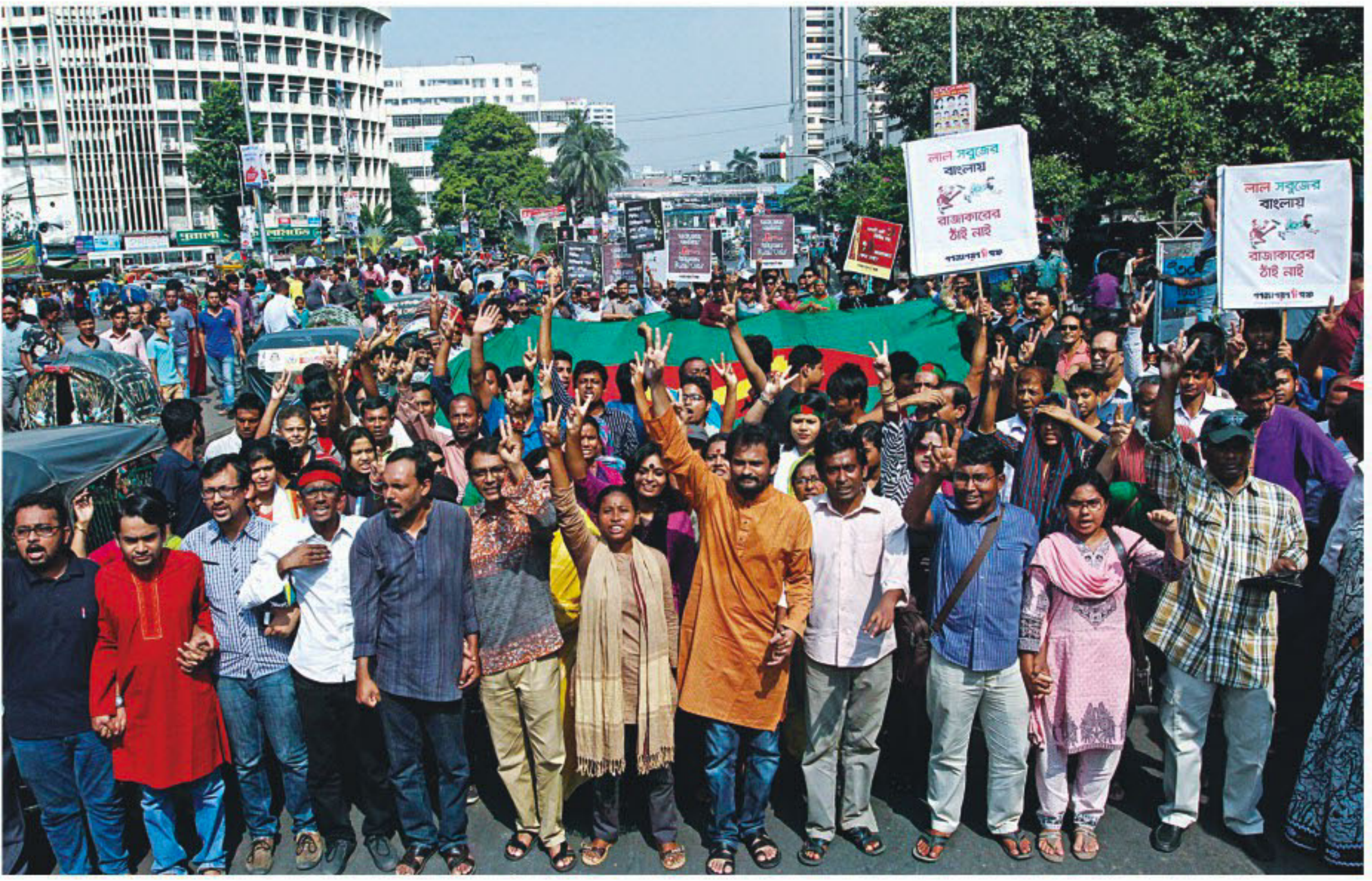
Yet another victory for Gonojagoron Mancha after the Supreme Court yesterday upheld the death sentence on Jamaat-e-Islami leader Muhammad Kamaruzzaman, an Al Badr commander condemned by the International Crimes Tribunal-2 on May 9 last year. The anti-war crimes campaigners celebrate the moment at the capital's Shahbagh, the birthplace of the Mancha.