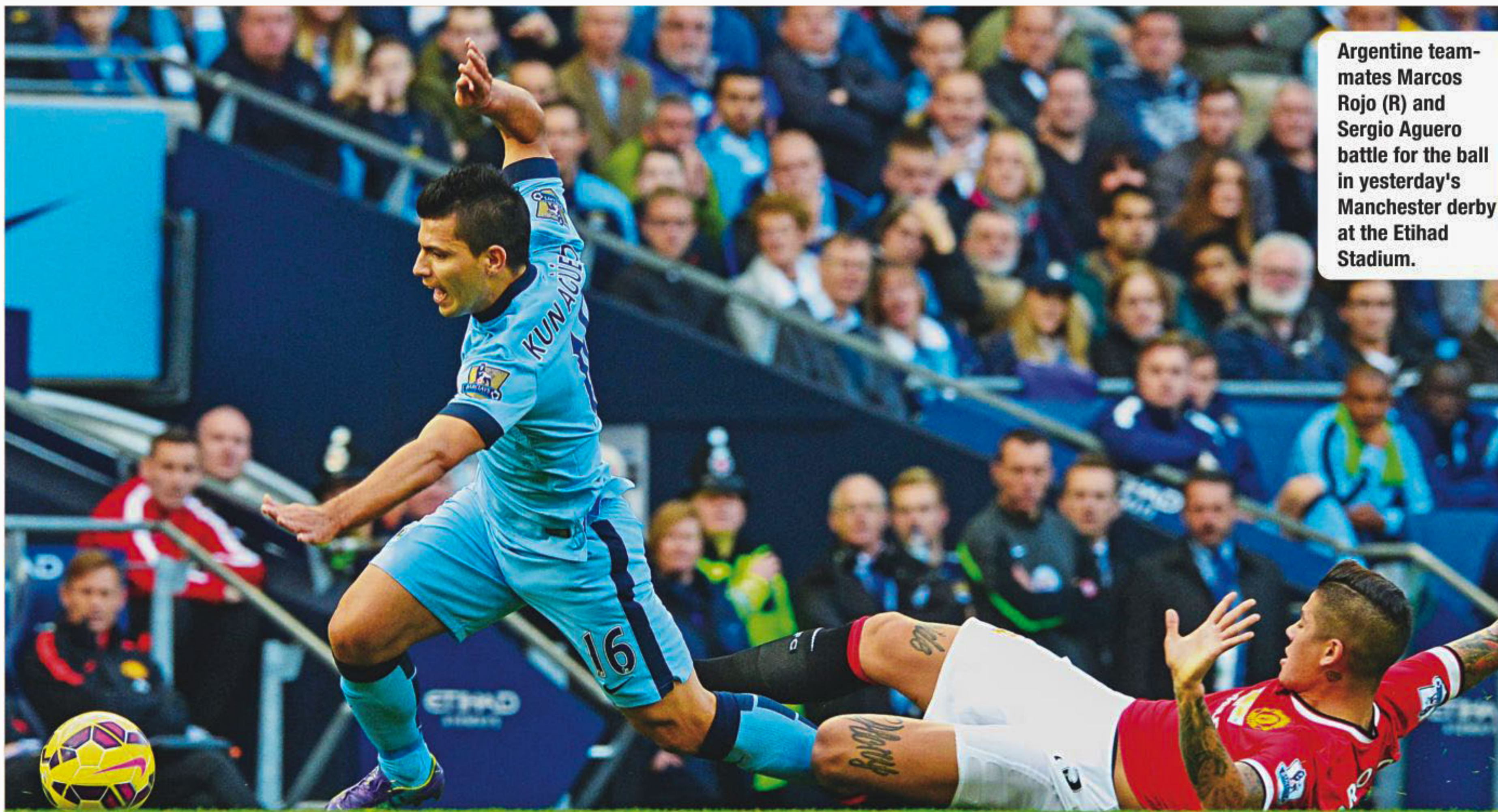
Argentine teammates Marcos Rojo (R) and Sergio Agüero battle for the ball in yesterday's Manchester derby at the Etihad Stadium.

Marseille, who lost at Lyon last weekend, have 25 points ahead of their home game with Lens on Sunday and PSG have 24, as these two giants of French football get ready to go head-to-head in Paris next weekend.