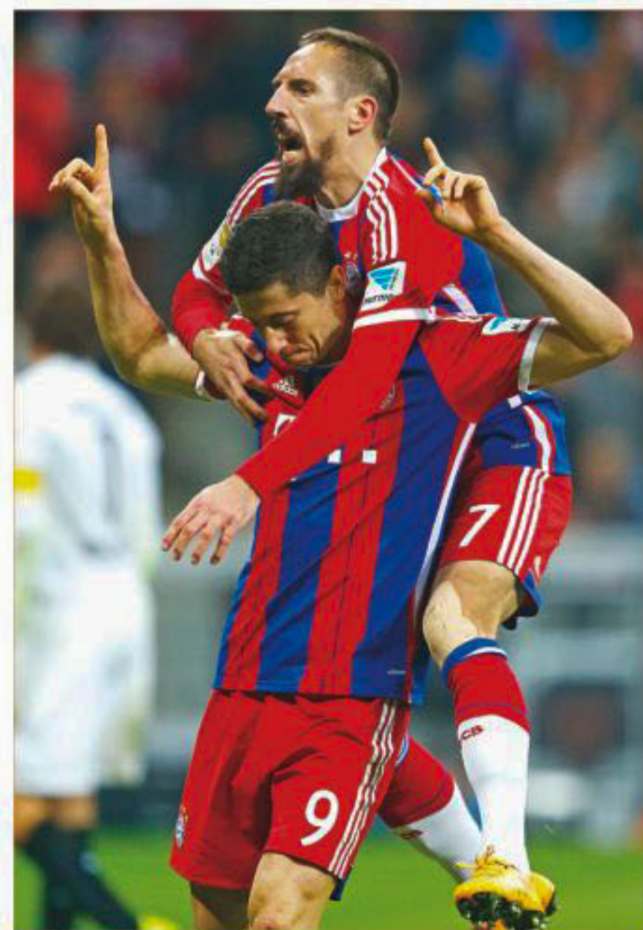
Robert Lewandowski of Bayern (bottom) celebrates his opening goal against his former team yesterday.

Hamburg 1 (Van der Vaart 26-pen) Bayer Leverkusen 0 Bayern Munich 2 (Lewandowski 72, Robben 85-pen) Borussia