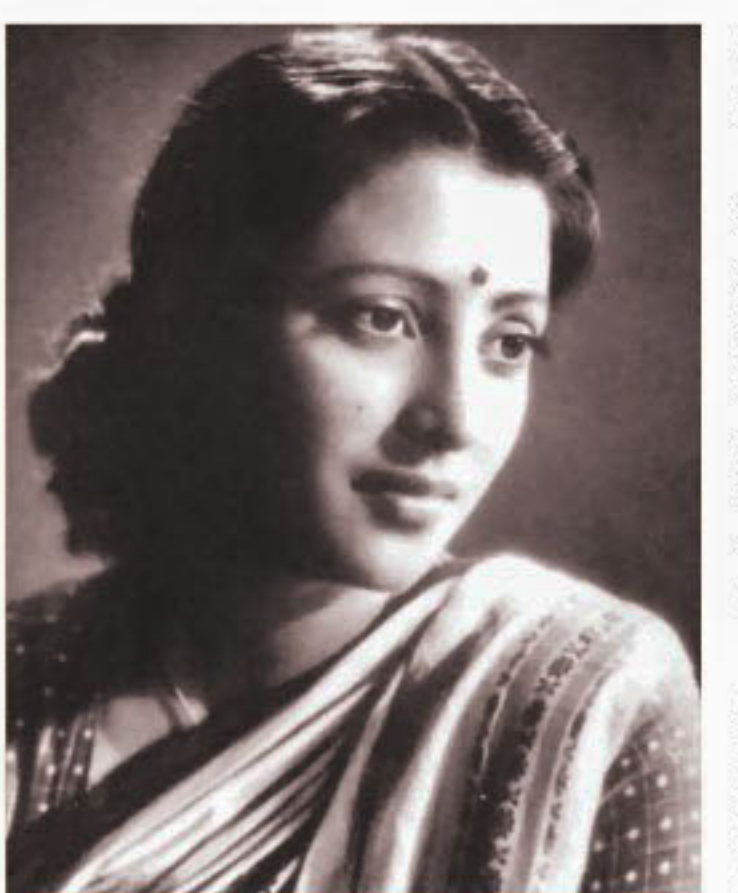
The festival will pay tribute to Suchitra Sen.

A new competitive segment featuring films by women directors, a galaxy of Bollywood stars and a retrospective of late screen legend Suchitra Sen will be the highlights of the 20th edition of the Kolkata International Film Festival (KIFF) to be held from November 10 to 17. Introducing new category -- International Competition (women director's films), organisers of the festival said on Saturday that the category would showcase 15 films made by women filmmakers from across the globe. The category had attracted 72 entries this year.