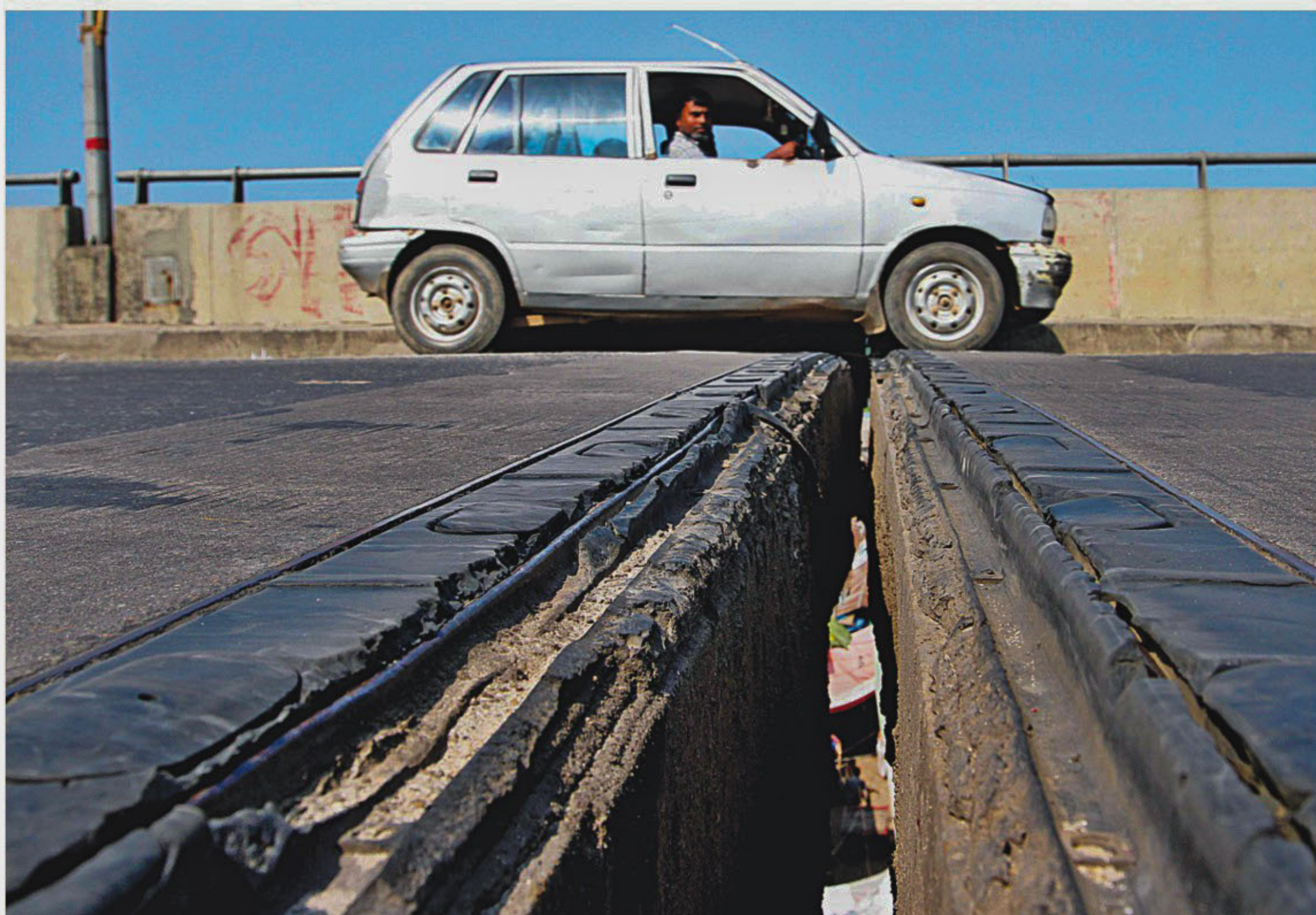
A rubber expansion joint at Sultana Kamal Bridge in the capital's Demra has allegedly been stolen by drug addicts over the time due to a lack of monitoring by the authorities. The joints are used to safely absorb vibration and allow smooth movement of vehicles. The photo was taken recently.

"India and Bangladesh are two developing countries. We both have a large population of youth. We both wish to transform our economies and societies."