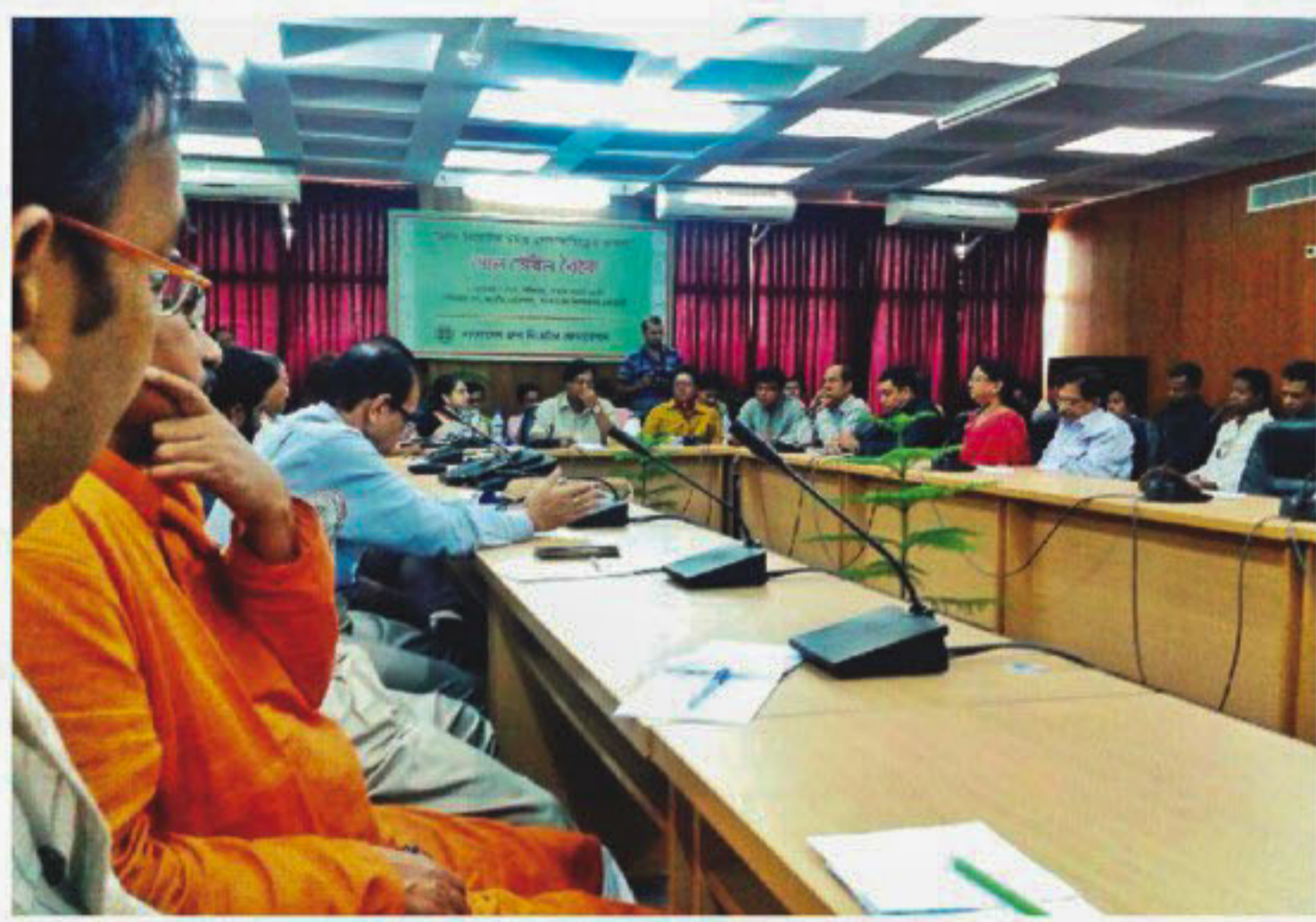
Theatre artists and activists at the event.