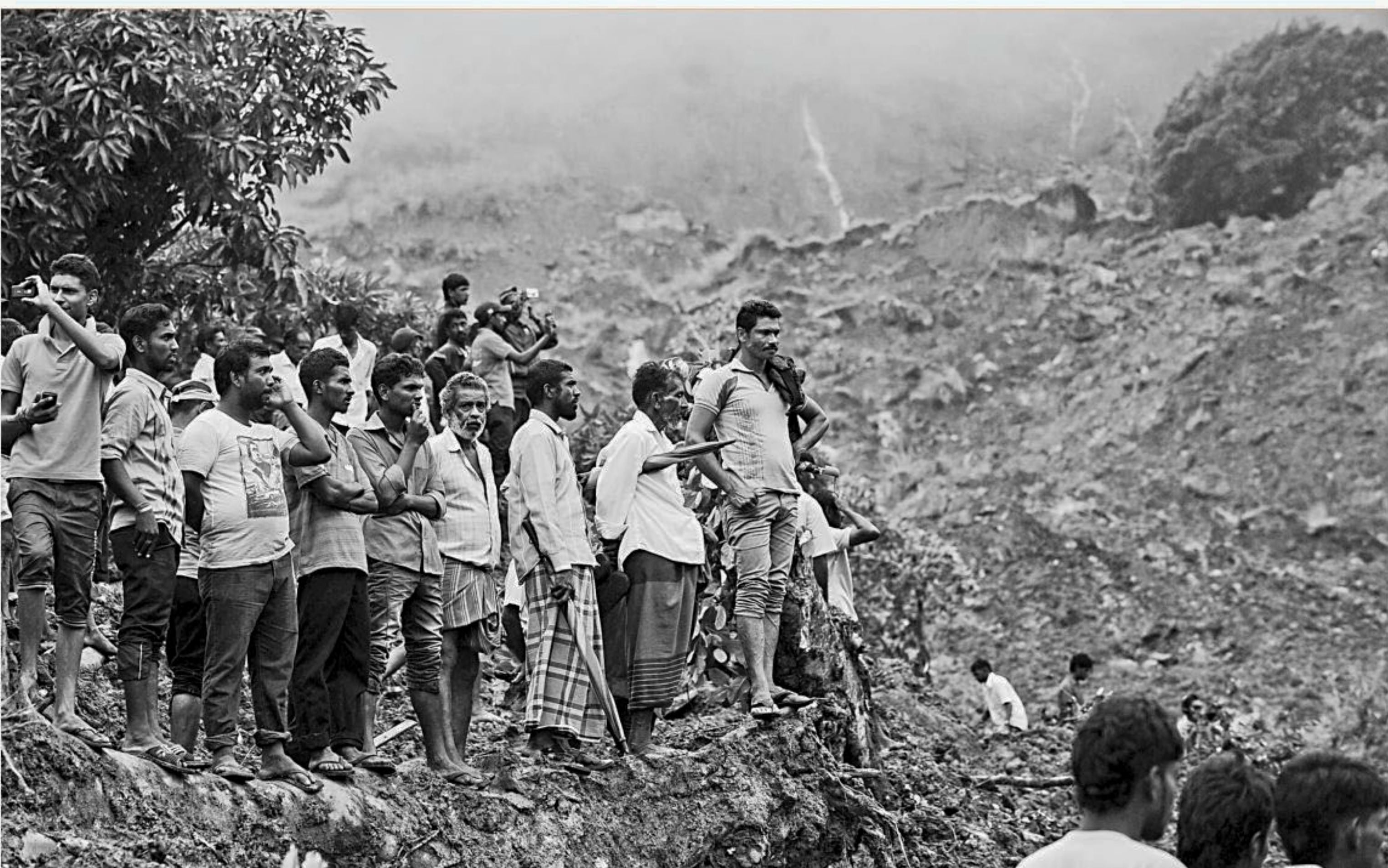
Sri Lankan residents watch search and rescue operations at the site of a landslide caused by heavy monsoon rains in Koslanda village in central Sri Lanka, yesterday.

Twenty-nine people were killed and thousands of civilians forced to flee Pakistan's northwestern region of Khyber, the military said yesterday, as it stepped up a two-week-old offensive against Taliban militants in the area. Meanwhile, a suspected US drone strike killed at least five militants in a Pakistani tribal region bordering Afghanistan yesterday, with local villagers saying the dead included of a senior Arab commander. U.S. drone strikes have escalated this month, hitting targets in tribal areas several times a week, but the latest strike comes just days after US and British combat troops in neighboring Afghanistan officially ended their operations. Twenty-one suspected militants and eight soldiers were killed on Wednesday, the military said in a statement, but gave no figure for civilian casualties. National disaster officials say the fighting has forced more than 18,000 people to abandon their homes. Residents of the area say many people are caught between the two opposing forces, as the military orders them to leave and the militants urge them to stay. The military said it had killed dozens of militants in airstrikes and fighting since the fighting began in Khyber. The Khyber offensive began two weeks ago in the area around the Tirah Valley, a key smuggling route into neighbouring Afghanistan. At the same time, the military is pressing on with a campaign against the Taliban it launched in nearby North Waziristan in June.