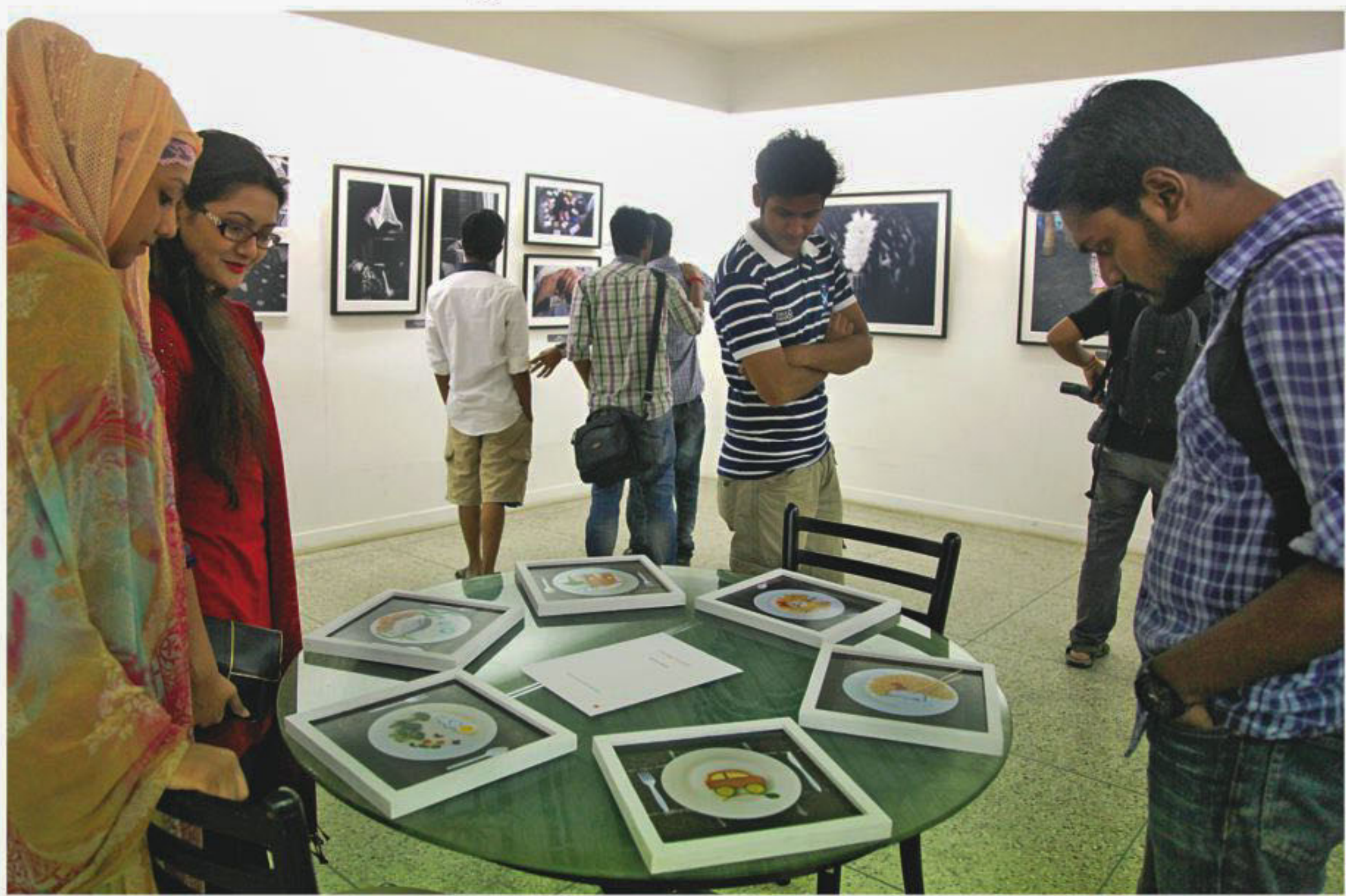
Visitors at the exhibition.