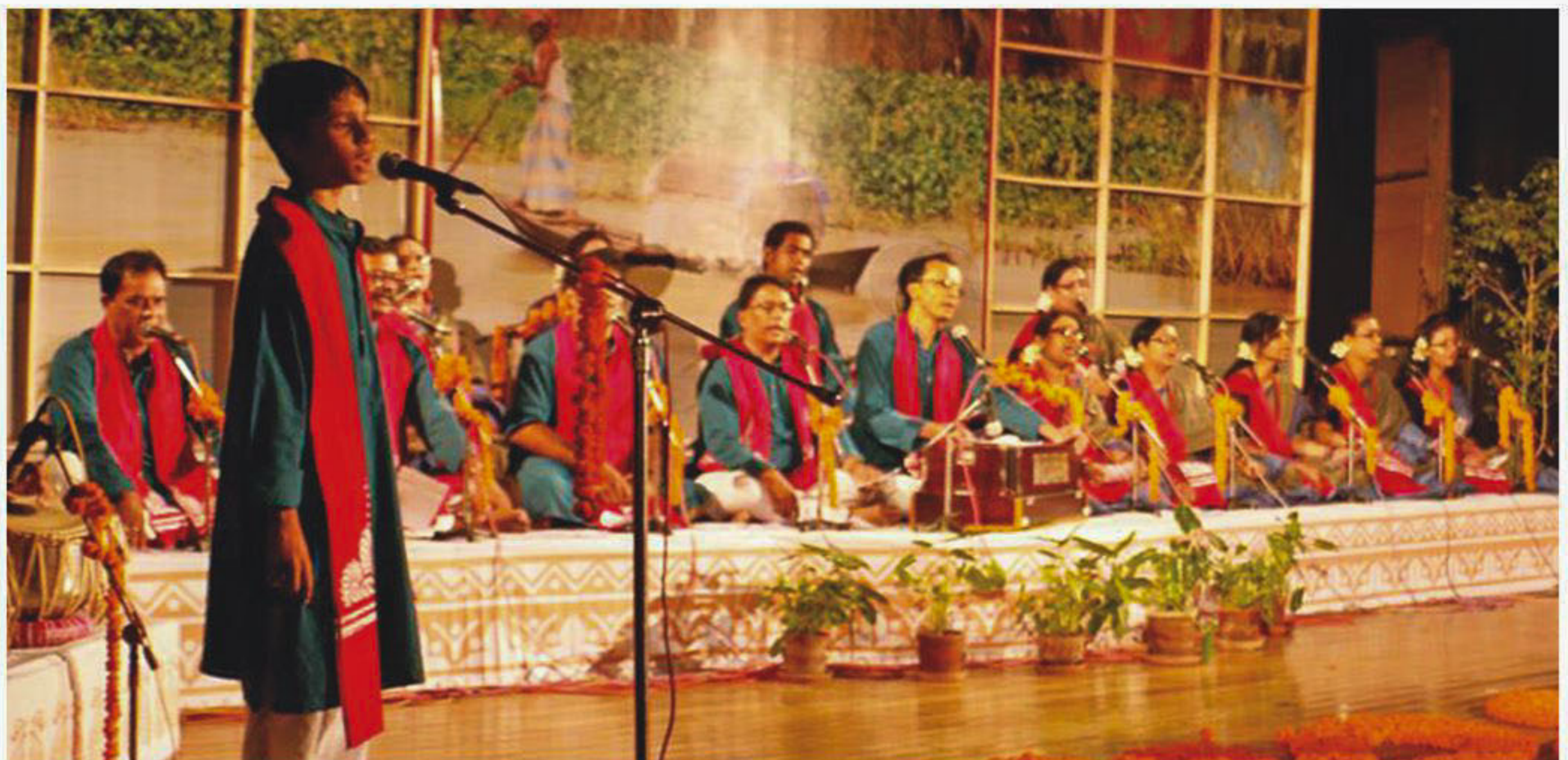
A new organisation, Joltorongo, emerged on the cultural map of Dhaka through a cultural programme held at the Chhayanaut auditorium recently. An eager audience enjoyed the songs and recitations at the event, that was inaugurated by thespian Aly Zaker, artist Samarjit Roy Chowdhury and singer Sadi Mohammad.

The gallery will remain open from 10am to 9pm everyday.