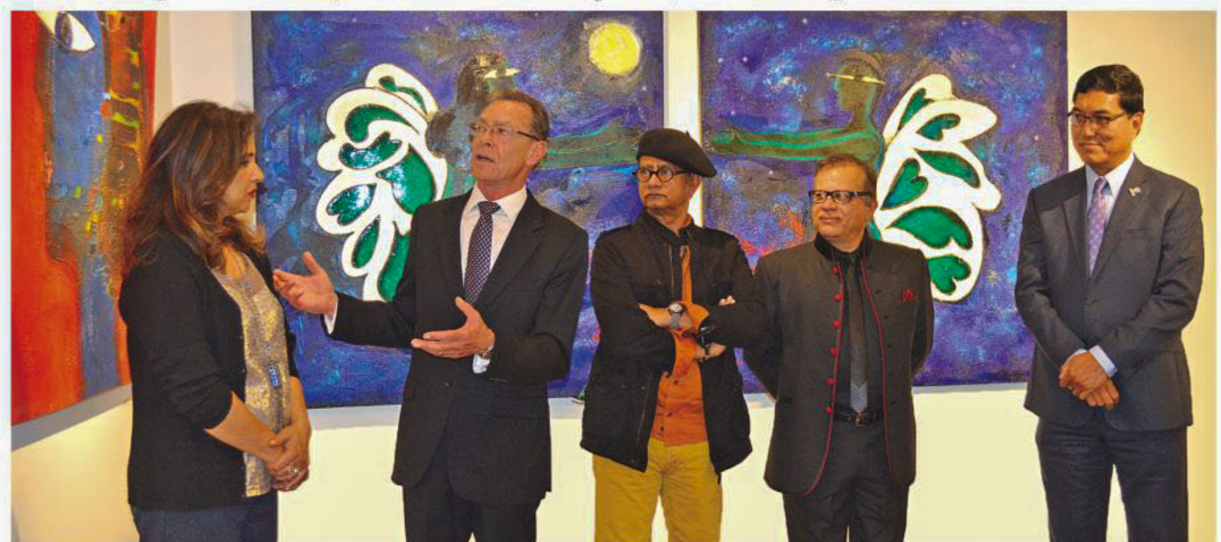
Guests are at the exhibition.

One common denomination of his works is the penchant for treading acrylic on canvas. That may be why his female forms are so captivating in their inducement, and nature blooms with so much blushes and brightness in his brushes. Simply put, this exhibition has a spellbinding appeal, thanks to the most organised, emotion-laden and consolidated presentation of his works. If the 'Tears of Nature' and the 'Mindscape' have earned him recognition in the past, the 2014 Toronto exposition is a clear example of how far he has come.