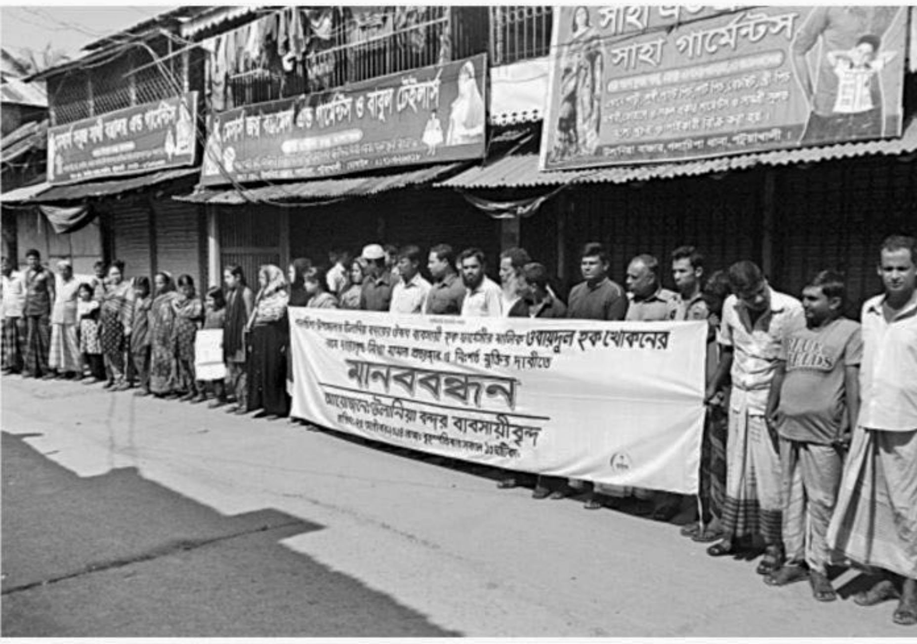
Traders form a human chain at Ulania Bazar in Galachipa upazila under Patuakhali district during their half-day hartal yesterday demanding withdrawal of what they said false case against a medicine shop owner and his release.