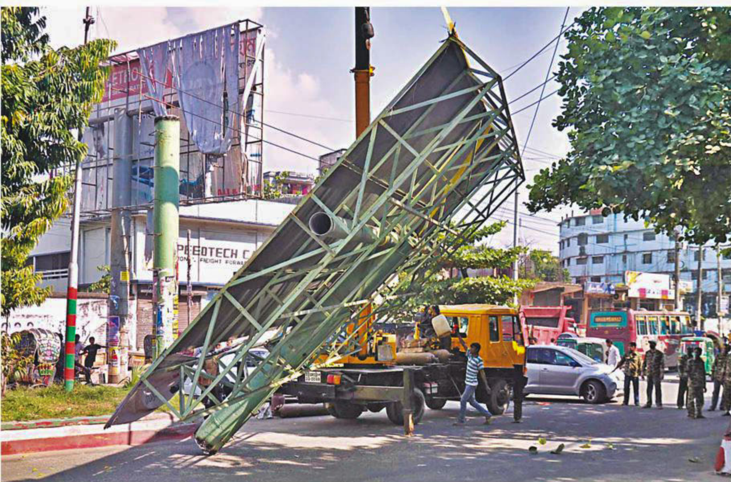
A mobile court has a huge illegal hoarding removed on Noor Ahmed Road in Chittagong city yesterday.