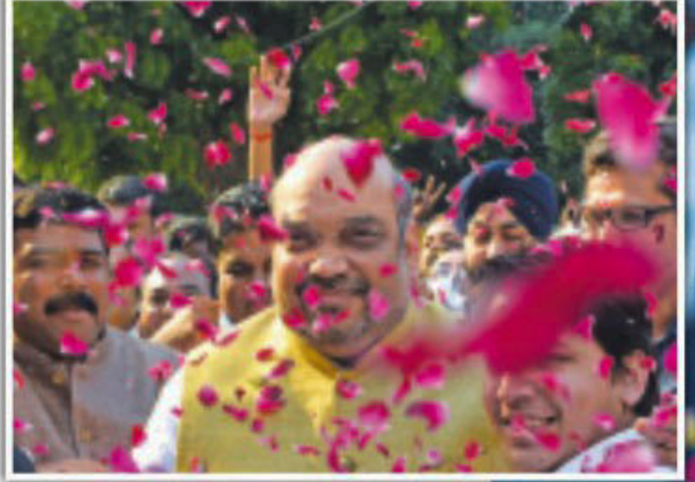
Indian Prime Minister Narendra Modi is greeted by Bharatiya Janata Party (BJP) President Amit Shah as Modi arrives at the party headquarters to attend the BJP Parliamentary Board meeting in New Delhi, yesterday. Inset, Amit Shah is being welcomed by jubilant supporters at the BJP headquarters.