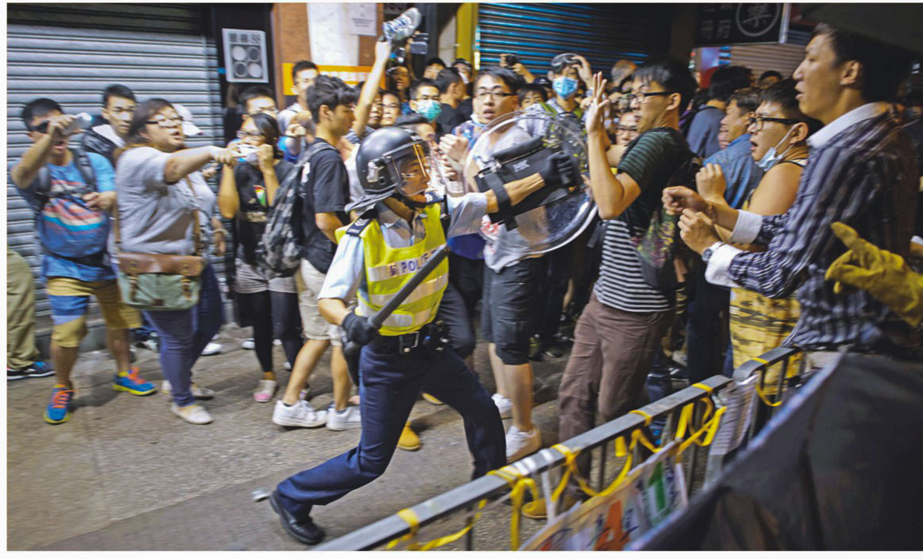
A policeman holding a baton advances towards pro-democracy protesters as they clash on a street in the Mong Kok district of Hong Kong early yesterday. Hong Kong's embattled government said it will open talks with student demonstrators tomorrow, after three nights of violent clashes between police and protesters who have paralysed parts of the city with mass pro-democracy rallies.

A roadside bomb killed seven Egyptian soldiers and wounded four in the restive Sinai Peninsula yesterday, security officials said. The bomb exploded next to an armoured vehicle guarding a gas pipeline in north Sinai, the officials said.