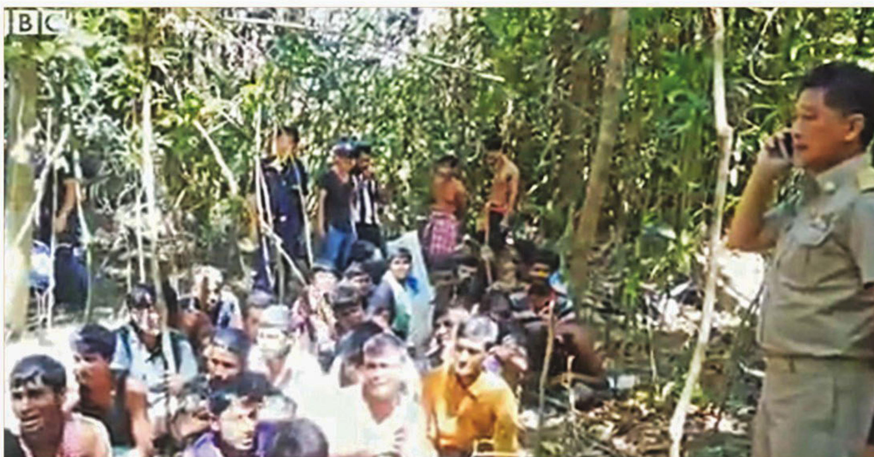
These people are among the trafficking victims who were rescued recently at a rubber plantation in the southern part of Thailand.