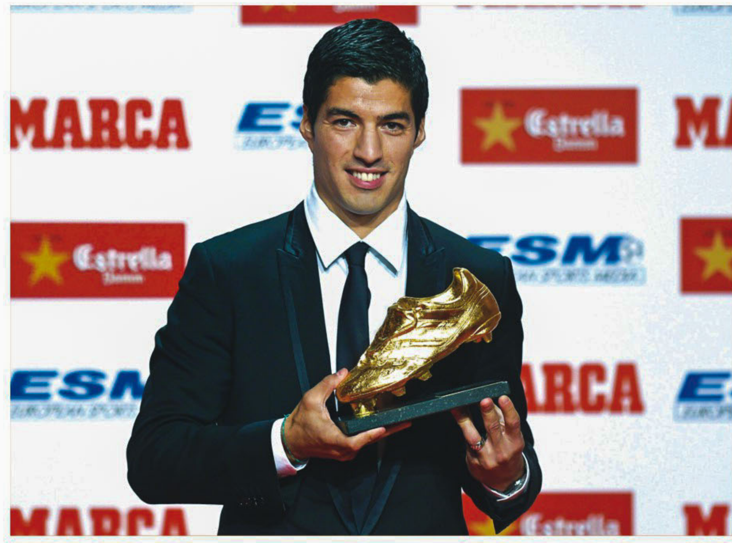
Barcelona striker Luis Suarez poses with the 2014 Golden Boot award in Barcelona on Wednesday.