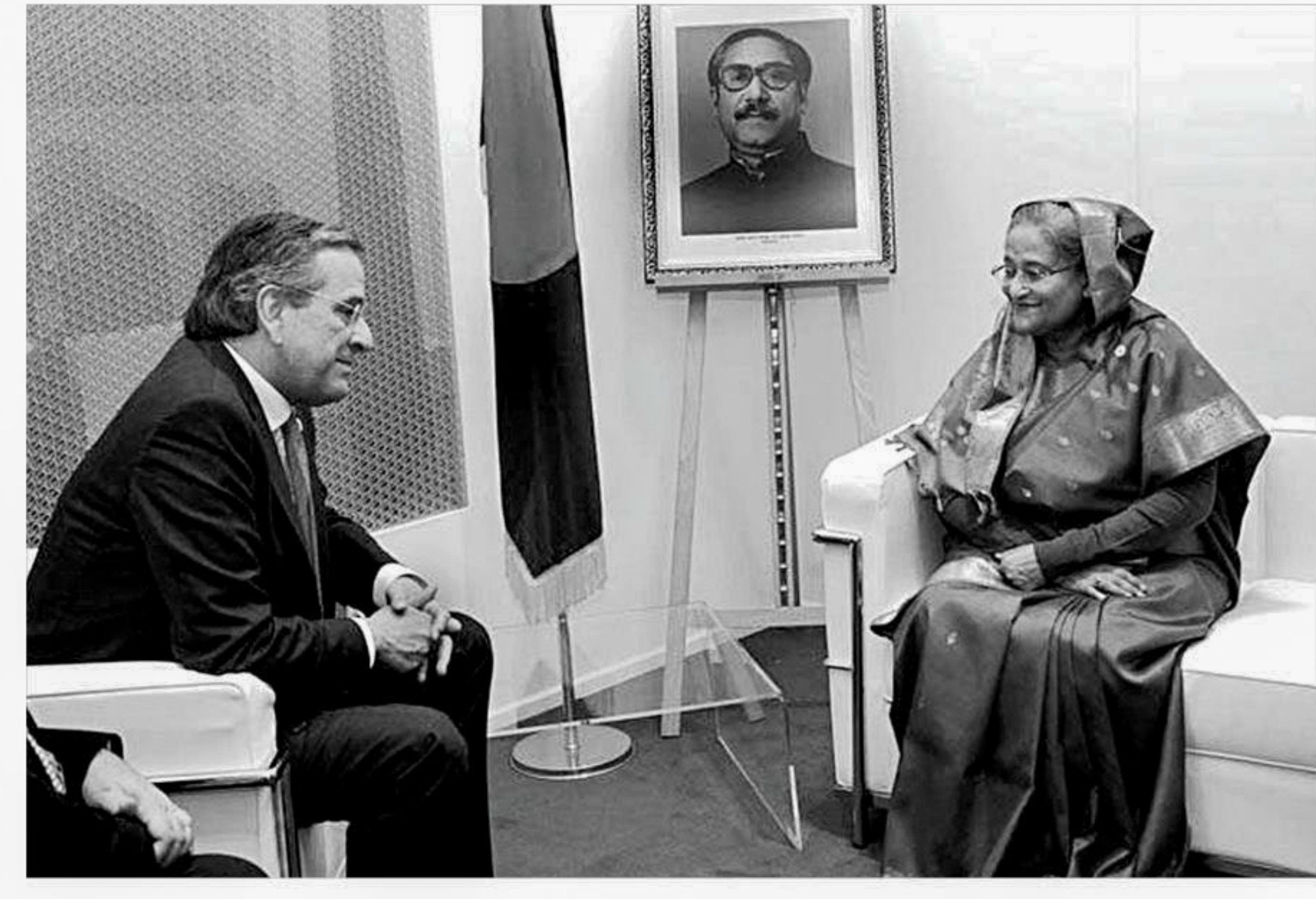
Prime Minister Sheikh Hasina with Greek Prime Minister Antinios Samaras at a meeting in Italy's conference centre, Milano Congressi, yesterday. Story on page 3.

In another press release, Nagorik Samaj said the permission denial was "politically motivated".