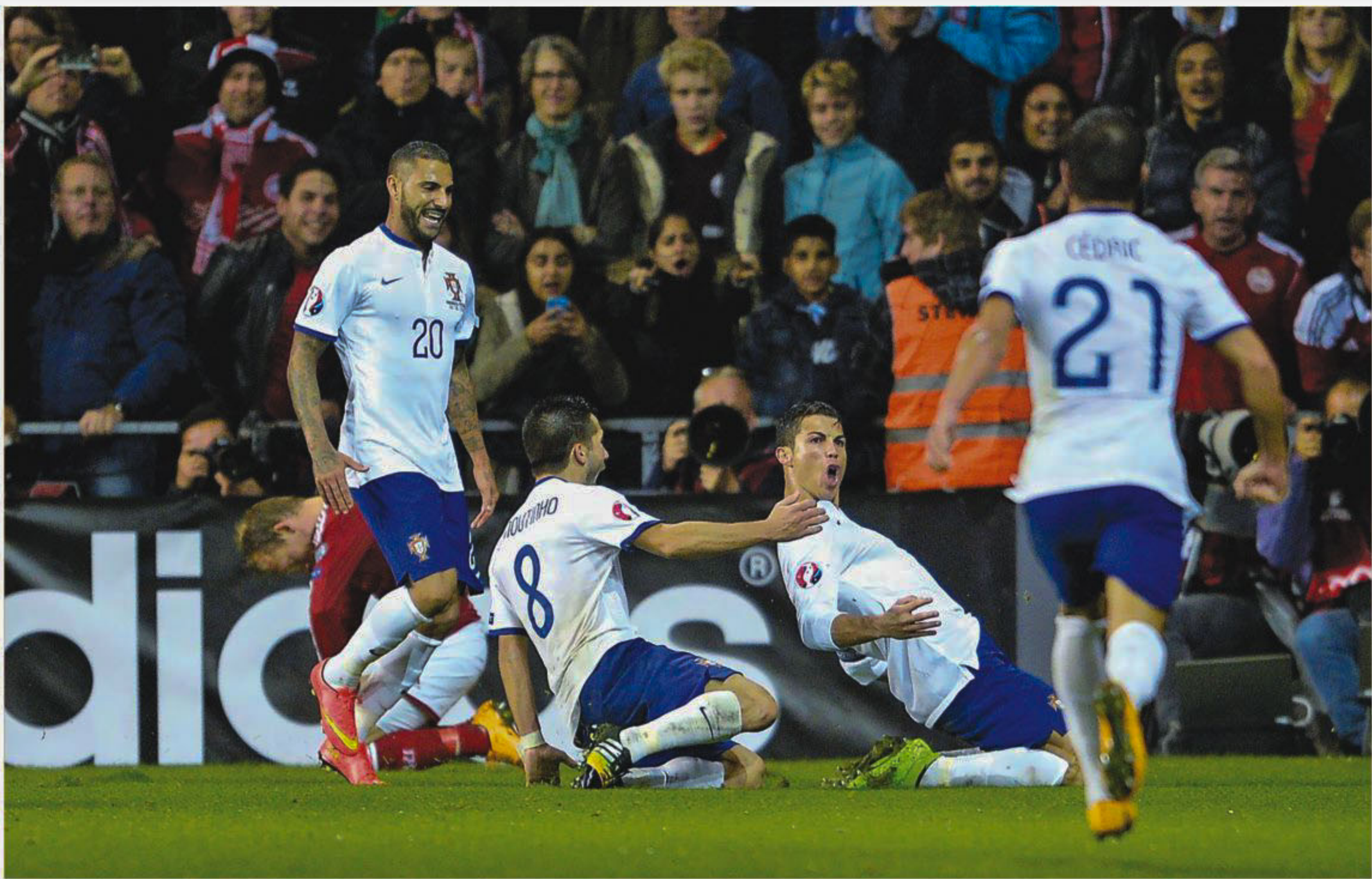
Portugal star Cristiano Ronaldo (2nd from R) celebrates his all-important goal against Denmark during their Euro 2016 qualifier in Copenhagen on Tuesday.