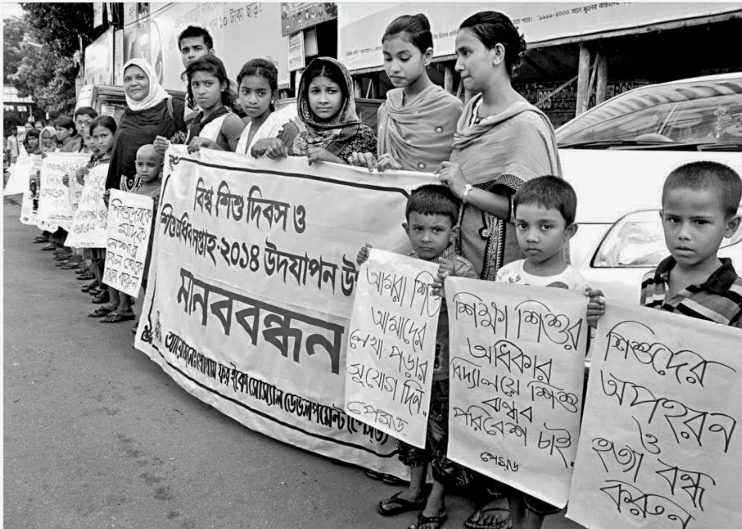
Program for Eco-social Development (PESD) forms a human chain marking World Children's Day, and Children's Rights Week-2014 at Satmatha in Bogra town yesterday.

The Special Judge's Court-3 of Dhaka indicted Khaleda and eight others in the case in March.