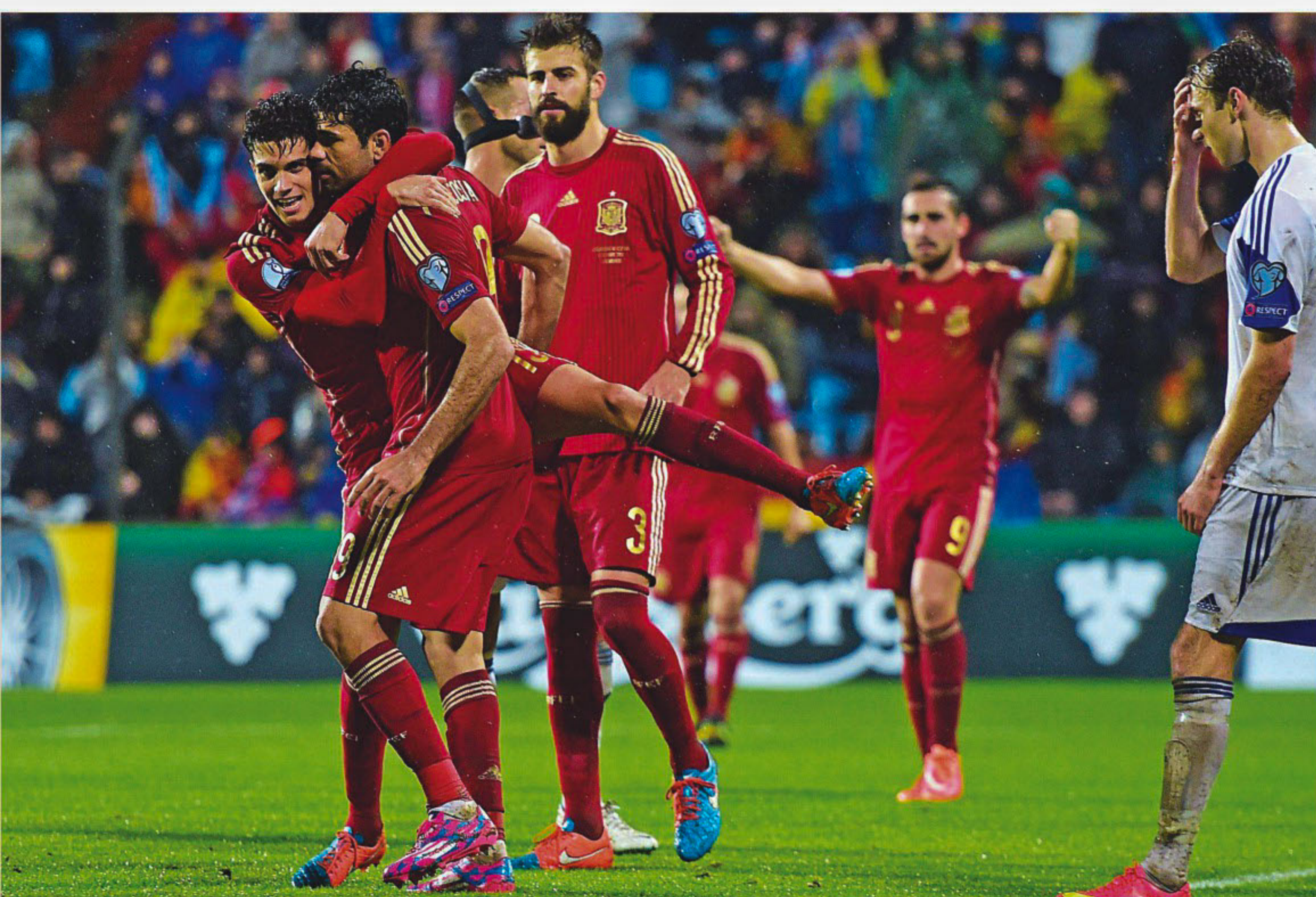
Spain striker Diego Costa (2nd from L) celebrates his goal with teammates during their Euro 2016 qualifier against Luxembourg at the Josy Barthel Stadium on Sunday. This was Costa's first goal for his adopted country.