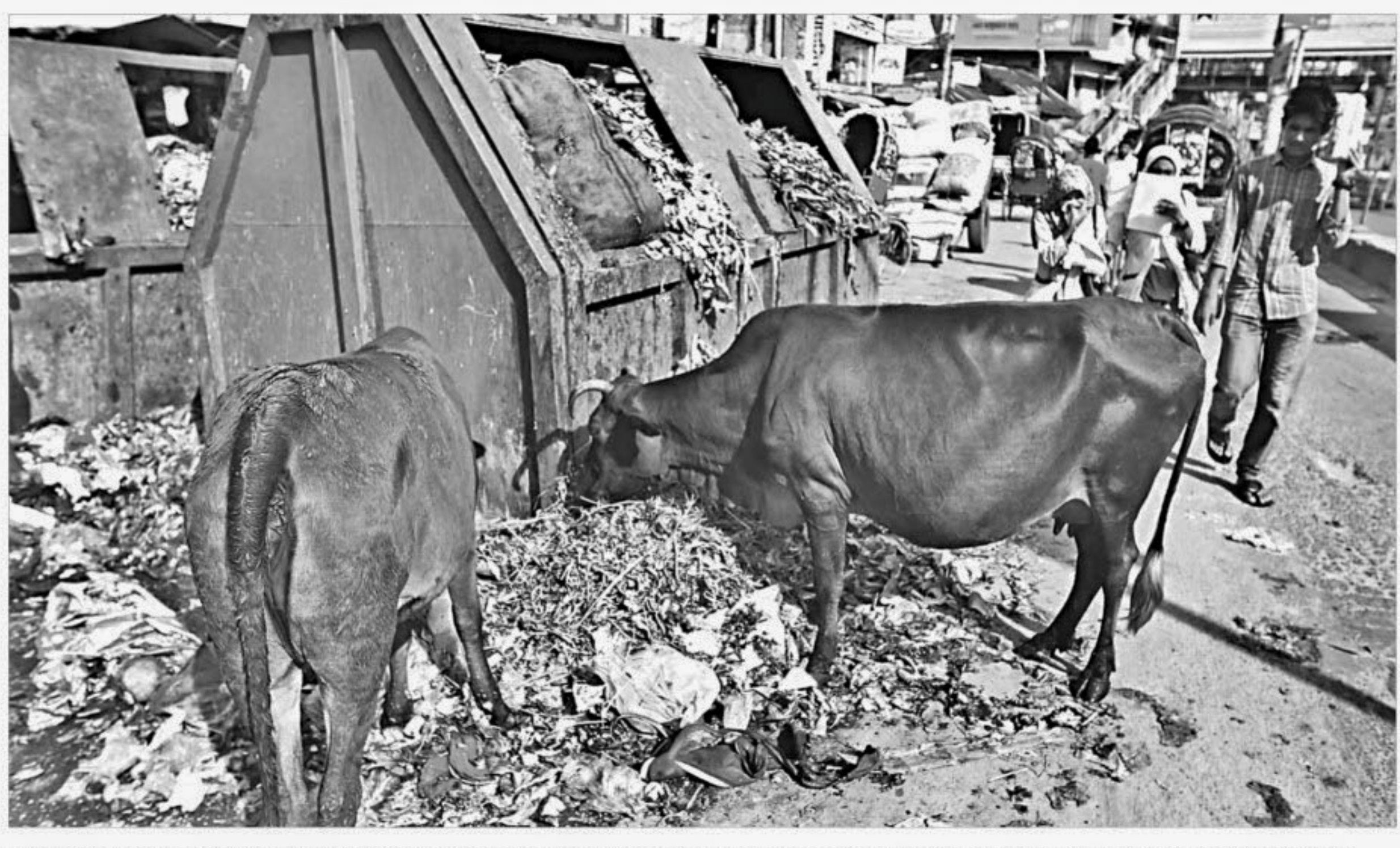
These two open dumpsters have taken up more than a half of a lane of Station Road in Chittagong city forcing pedestrians to walk almost in the middle of the road, and leaving almost no space for vehicles, let alone the stench they emanate all over the area. The scene is quite common on many roads of the city. The photo was taken yesterday.

Solve your UK legal problem from Dhaka Talk to an experienced lawyer on any legal issue in England No obligation No fee for taking opinion on Phone: 01741899906 C-870