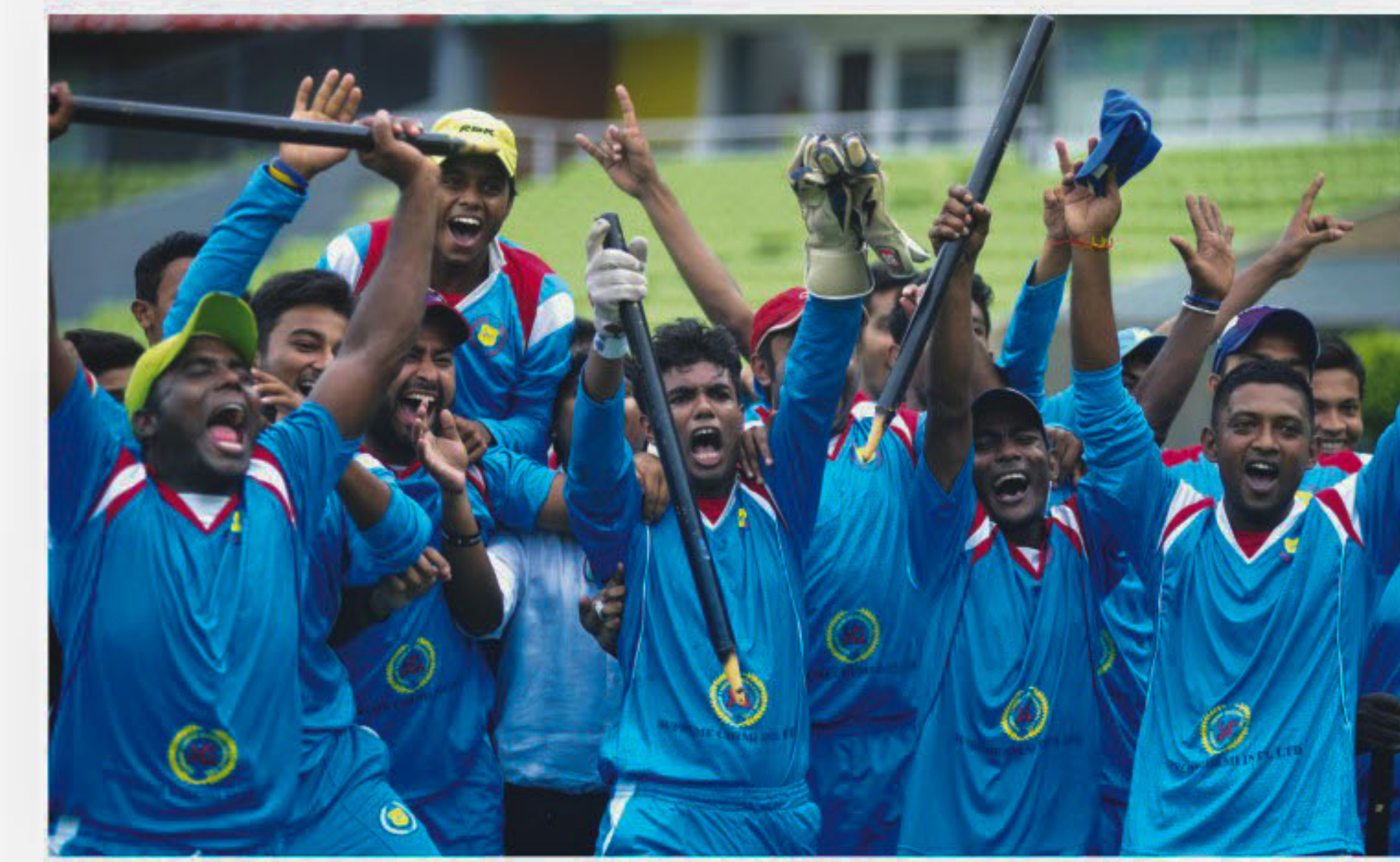
Indira Road Krira Chakra celebrate after winning the First Division T20 Tournament at the Sher-e-Bangla National Stadium yesterday. They beat Rapid Foundation by 19 runs.