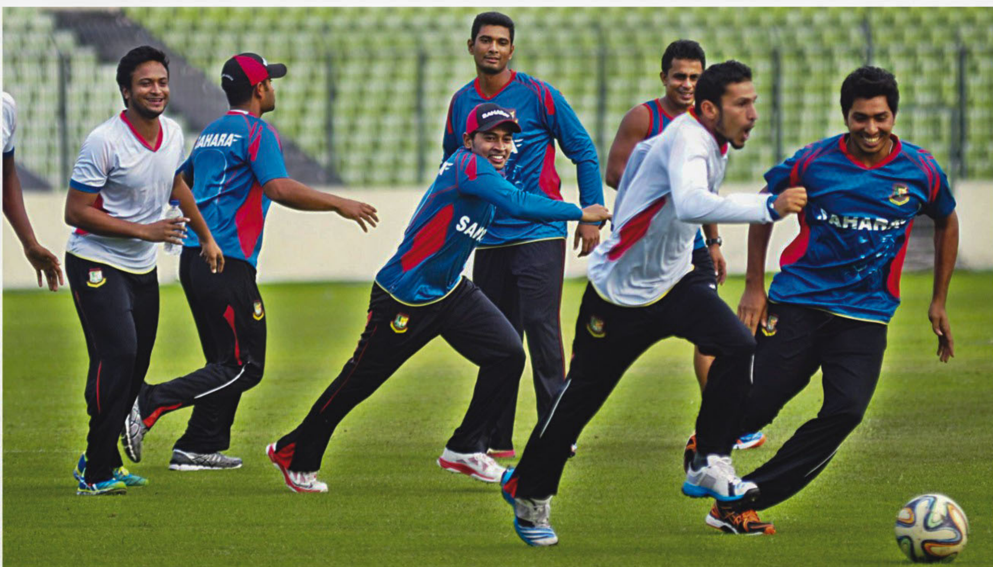
Bangladesh national team cricketers enjoy a light-hearted game of football on the first day of their training camp after Eid at the Sher-e-Bangla National Stadium in Mirpur yesterday.