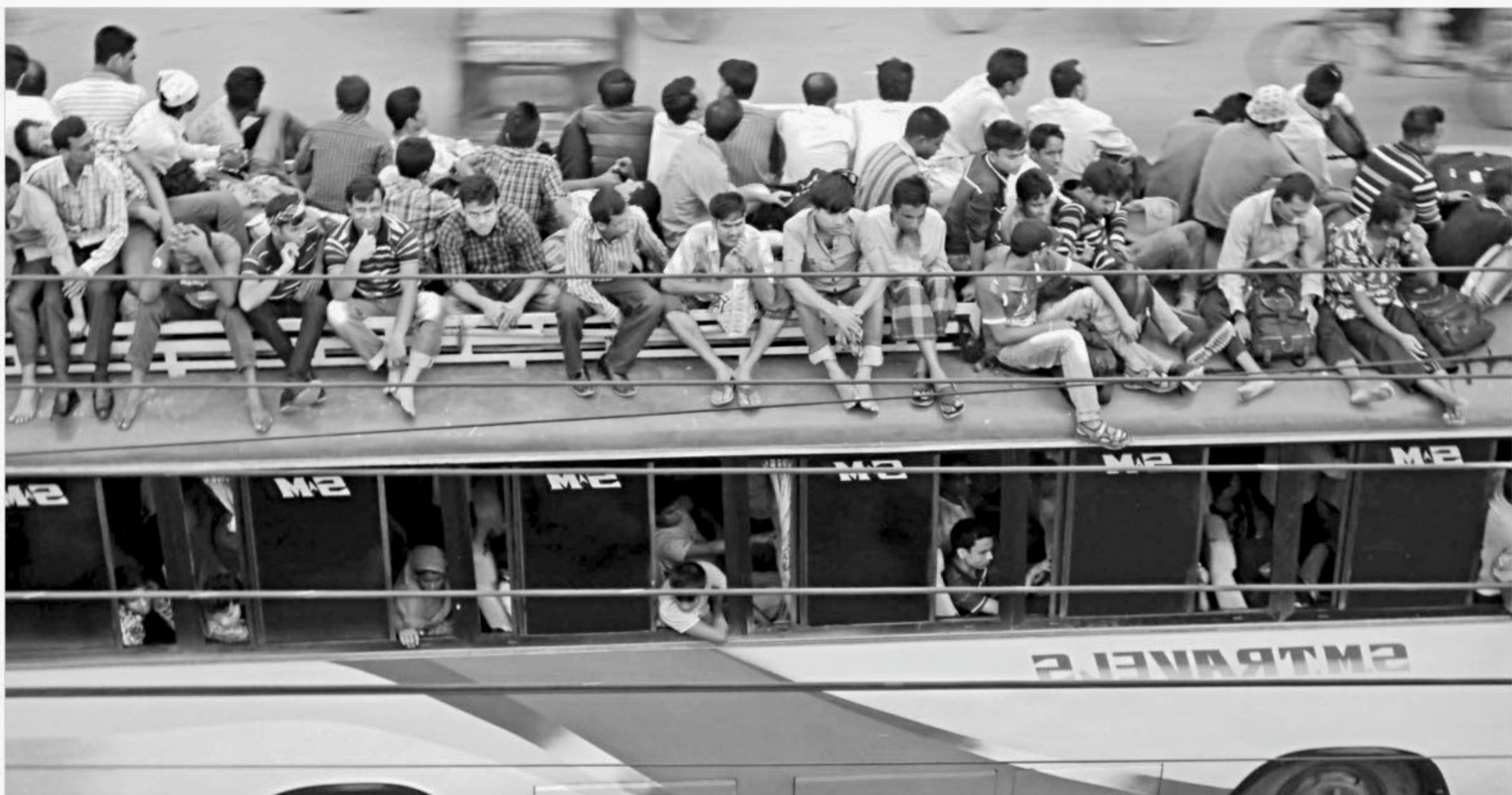
Despite paying double the usual fares, thousands of low-paid workers return to their workplaces after Eid holidays, riding the roofs of buses. This photo was taken from Dhunat intersection under Sherpur municipality of Bogra.