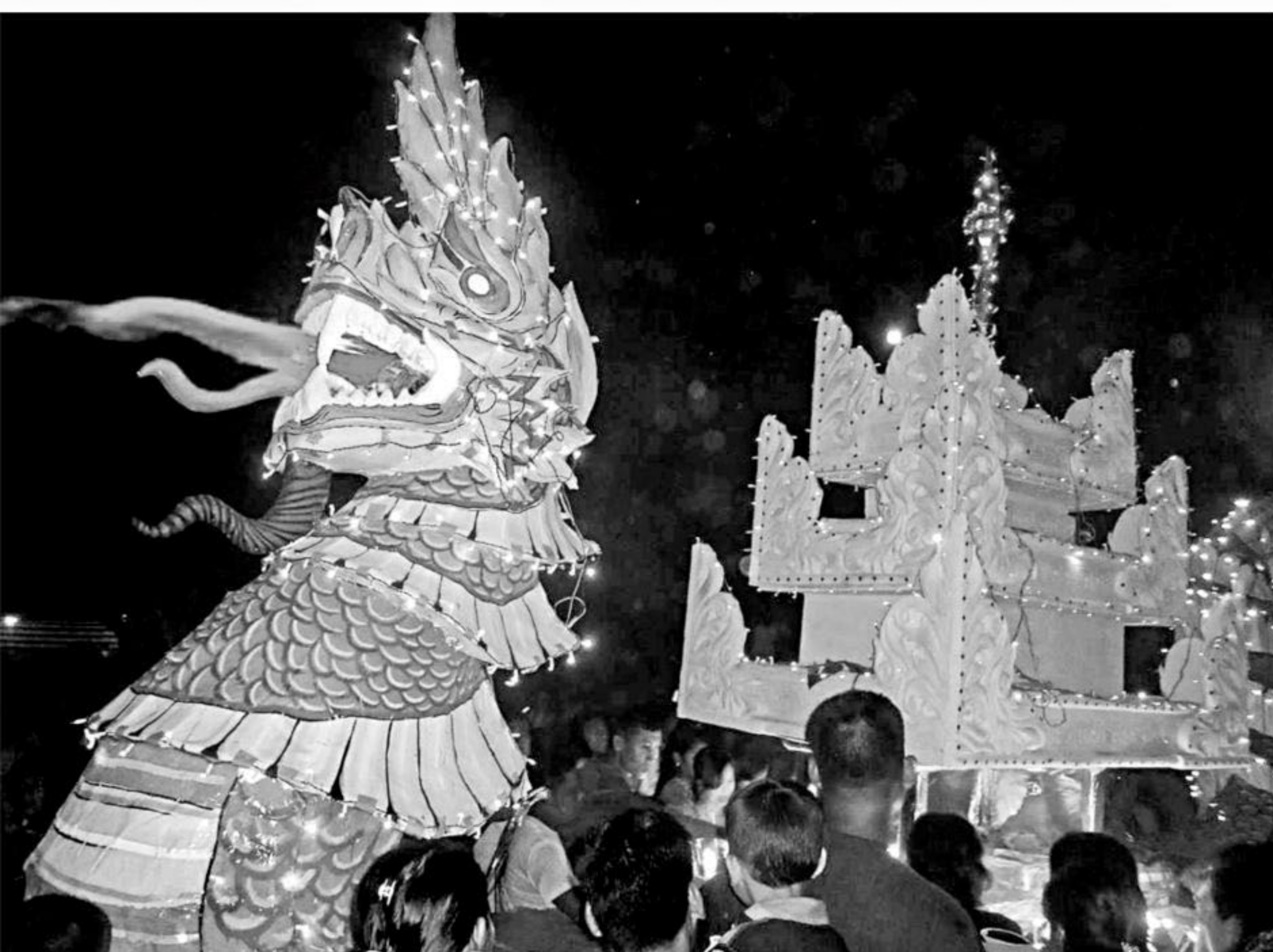
Indigenous people take out a colourful procession in Bandarban town yesterday, marking Mahaa Wagayawai Powe festival (Probarana Purnima).